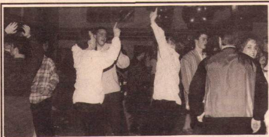
Many of the students who attended got to the dance early and danced all night. "YMCA" was a particularly popular number.

February 3rd was the long awaited date of the WPA dance. The