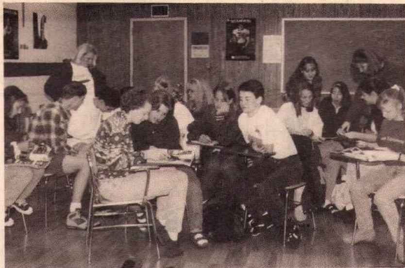
At one of the many Wednesday morning meetings, the junior prom committee decides on various prom decorations.

Prom '96 may see a couple of changes from proms of the past. The class of 1997 will sell souvenir glasses and picture frames. These will have the theme and a small picture printed on them. The prices of these items are yet to be determined. The change in times that prom is held has also been discussed. In the juniors numerous meetings they have discussed starting the dance at 9 p.m. instead of 8 p.m. If this happens the Grand March will take place at 8:30 with the dance ending at 12 a.m. Portraits Unlimited will take this year's pictures. These prices will be posted in the halls at a later date.