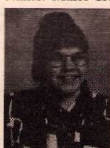
Age: 17 Activity: Band Other Activities: Choir, NHS, Musical Activity Highlights: Going to the State Marching Band Contest and