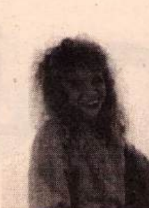
ballet, lyrical), volunteer Activity Highlights: the first issue of the 'Vox' and performing in dance competitions and recitals.

Activities: 'Vox' Editor, NHS, SODA, FBLA, dance (tap, jazz,