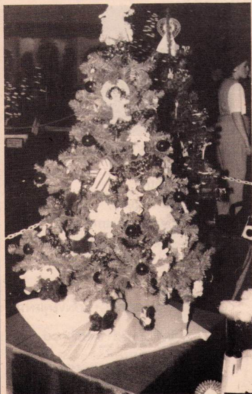
A tree with ornaments made by Ceramics classes I, II, and III won first prize in the school division of the Festival of Trees. The festival was held November 15-19 at the Five Seasons Center.