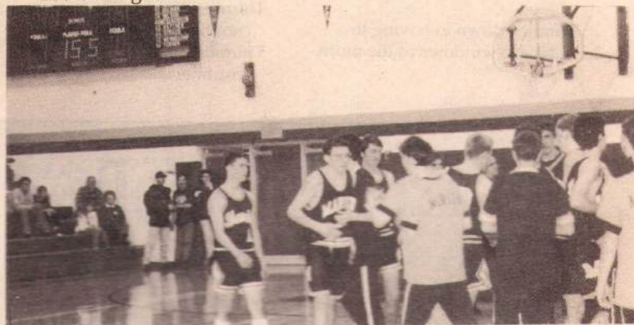
One of the happiest groups during spirit week was the sophomore basketball team, who notched their first victory of the season.

Because of the busy winter season, the week of January 3 was the only time available for Winter Spirit Week. Although still recovering from winter break, students got into the spirit of the week with a victory over Linn-Mar in boys basketball. Also featured were the annual pom light routine, a dual wrestling meet, and another basketball game Friday evening. The WPA dance was held Saturday evening in the lounge.