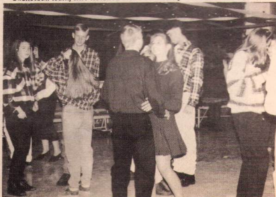
MHS students and their friends enjoyed the lounge decorated by the cheerleaders and poms.