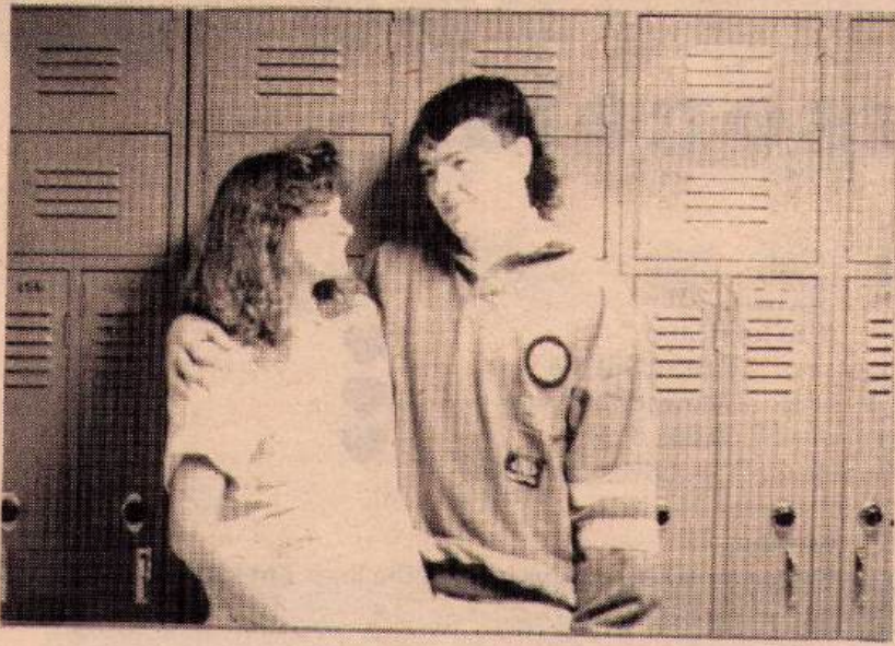
Candy, do you love me now that I can dance?