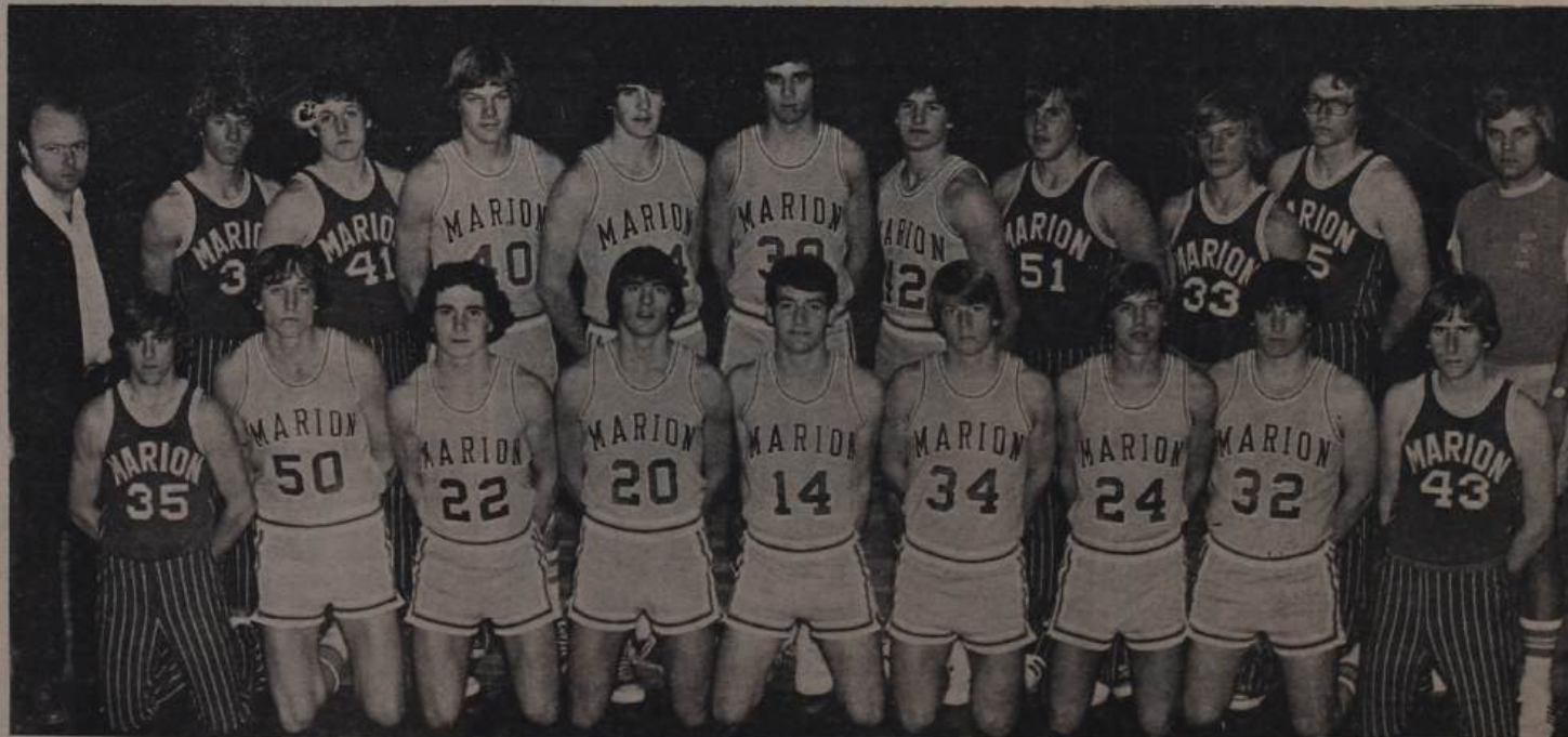
1976-77 VARSITY SQUAD

The next games before Christmas are Dec. 14, against Prairie (which they won 107-53) and Dec. 17, against Tipton, here. Hope to see all of you there and good luck boys!!