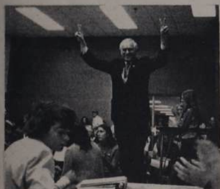
Candidates' Day found lots of enthusiasm.