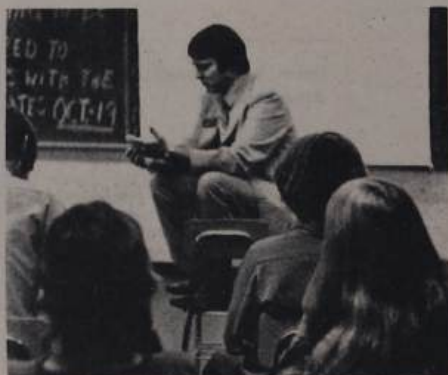
Students found the candidates gave serious thought to their questions.

On Oct. 19, our hallowed halls suffered a minor invasion of the candidates running for every imaginable office. The idea was to educate the students in the workings of our political system, the responsibilities of different offices, and the "stands" of the candidates on campaign issues. Candidates were assigned rooms and the students were free to visit candidates of their choice during nine 20-minute periods. In addition, there was a presentation on the three proposed constitutional amendments by the League of Women Voters, a voting machine, and a lively program of cam-