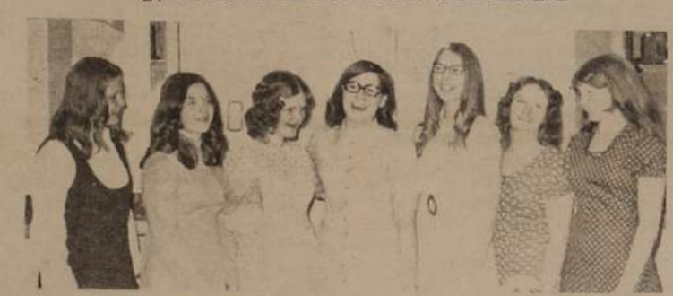
QUILL & SCROLL INITIATES