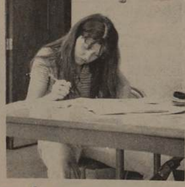
"In store for next year's senior editor-day: Monday through Friday, time: 7:45 until