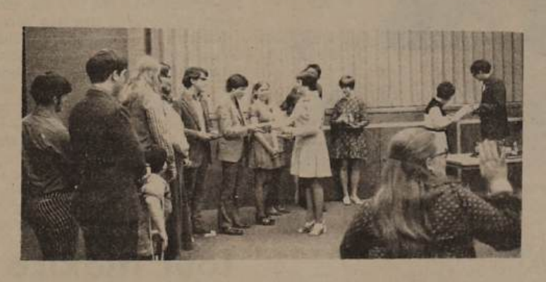
"Gee, is that for me?"