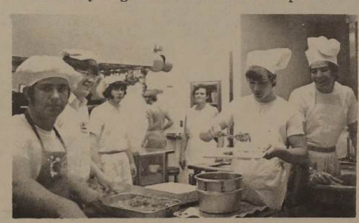
"One lump. . . or two?!"