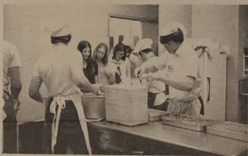
"How do you get this stuff off the spoon?"