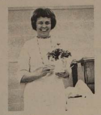
"I AM saying 'cheese'."