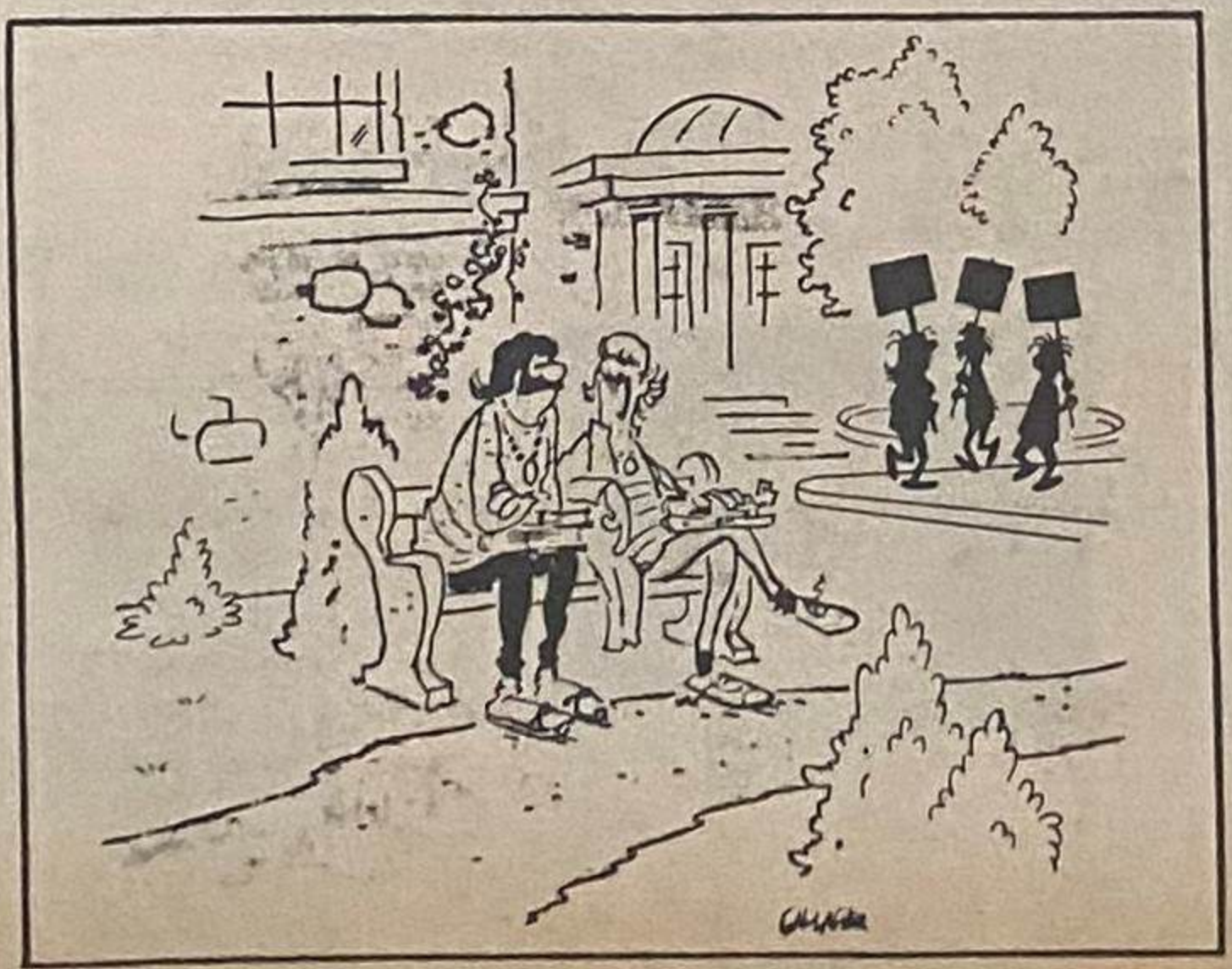
"NEXT WEEK WE START AGITATING FOR WHITE BOARDS AND BLACK CHALK."