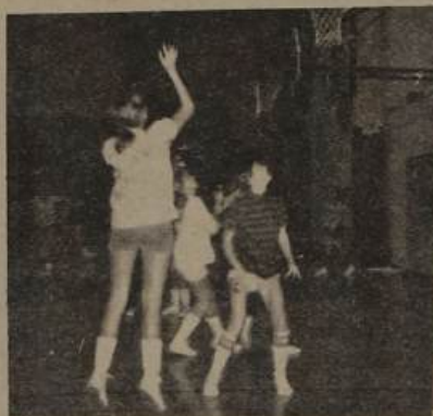
THE GIRLS ARE LEARNING TO STAY ON THEIR TOES!