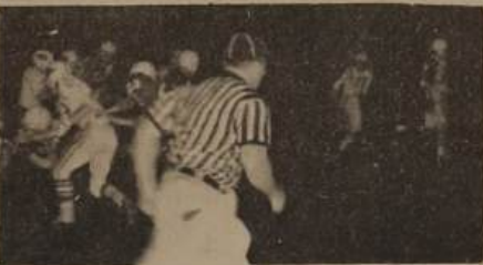
"WHICH WAY YA GOIN', SILLY?"