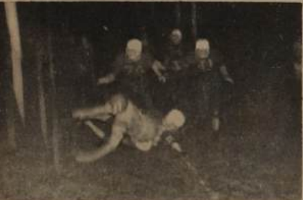
"RAIN, RAIN, GO AWAY. COME SOME NIGHT WHEN WE DON'T PLAY."