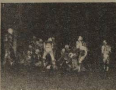
I'VE SEEN TIGHT SPOTS BEFORE, BUT THIS...!