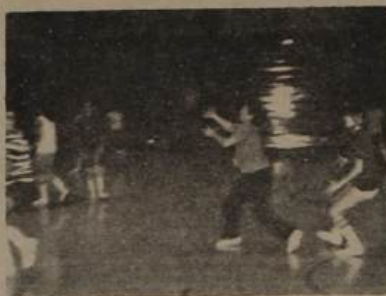
"UP, DOWN... TURN AROUND!"

On behalf of the cheerleaders, I would like to thank all the loyal and spirited fans for showing up at all the games and helping us cheer our Wamac Champs on. I think it really showed at the last pep assembly, which was optional, that we have a lot of spirited kids with a lot of pride in our school. Last, but not least, I'd like to again congratulate the football players for winning the Wamac title and for their undefeated season which has made me, and I'm sure many others, proud to be part of Marion high school.