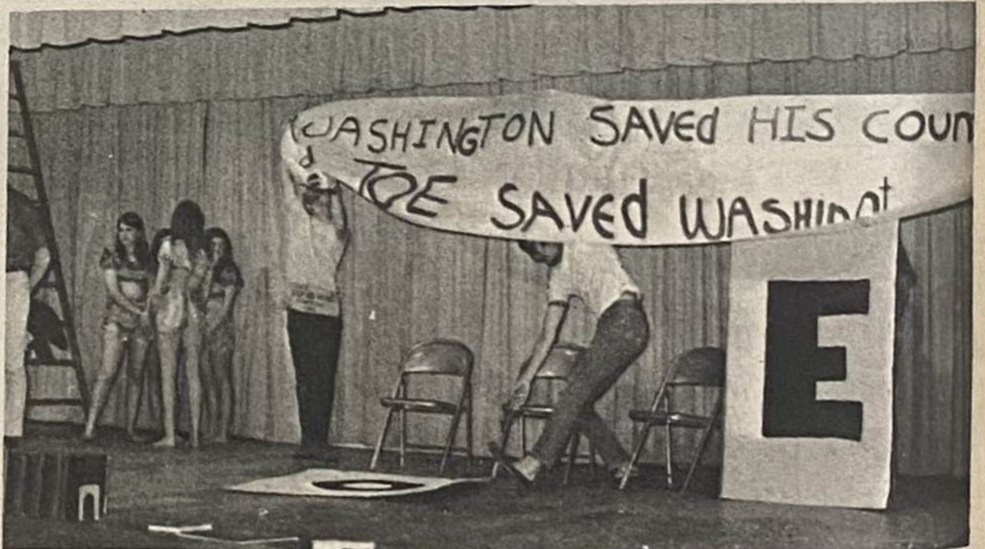
A celebration is planned to honor Joe