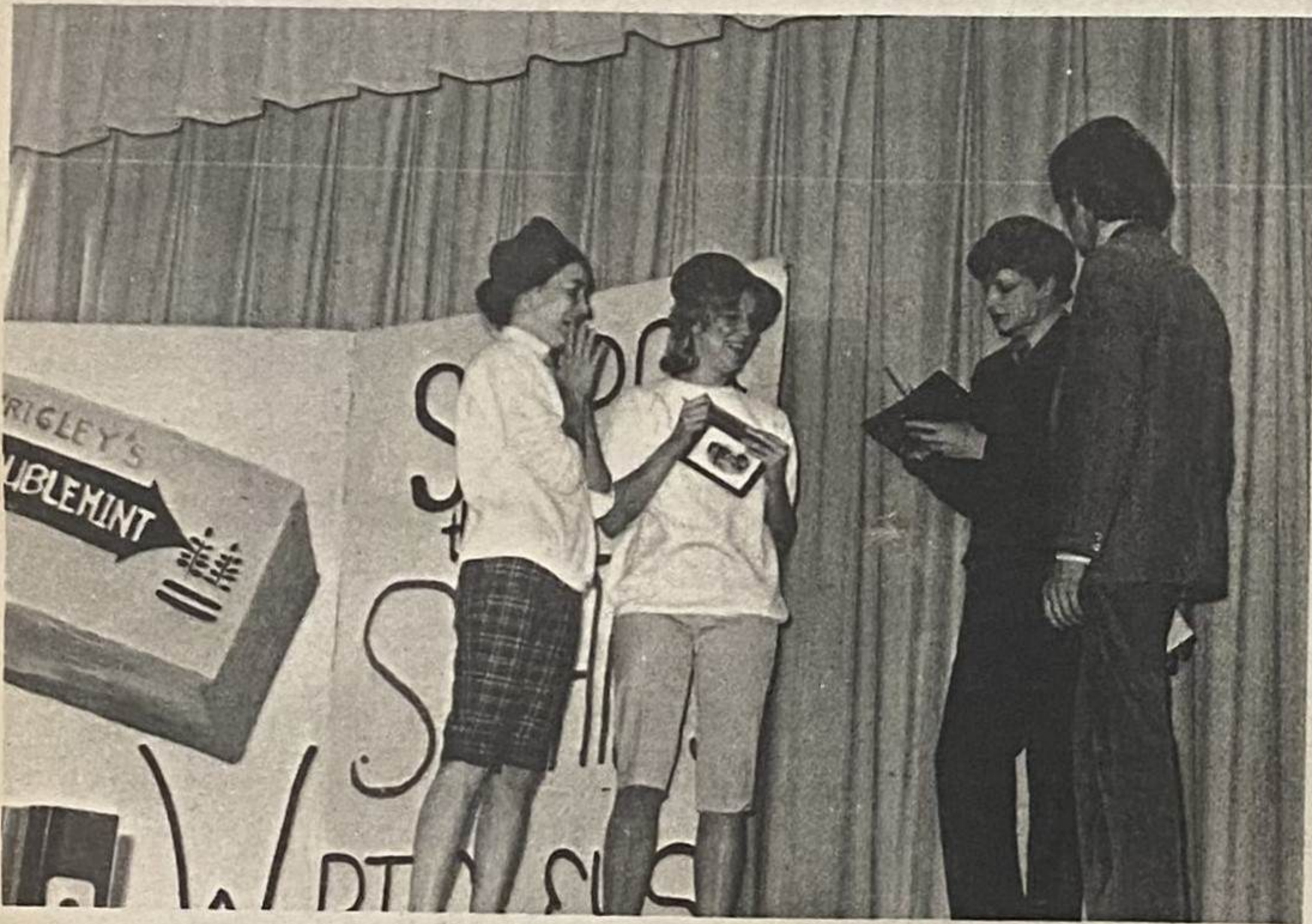
Two fans collect autographs