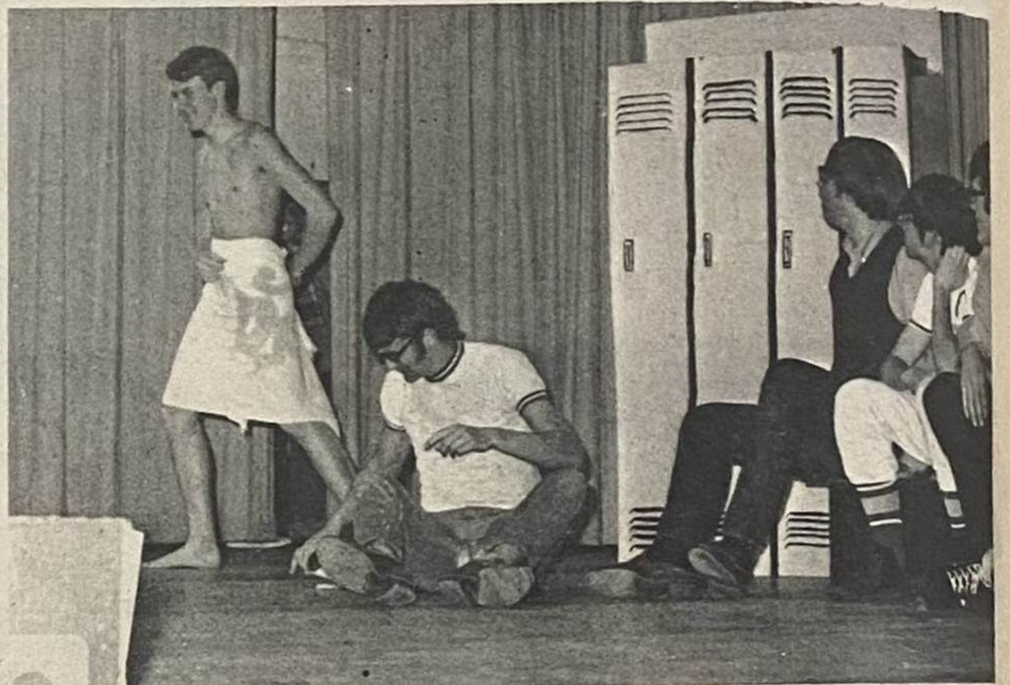
The reception committee for the Senators