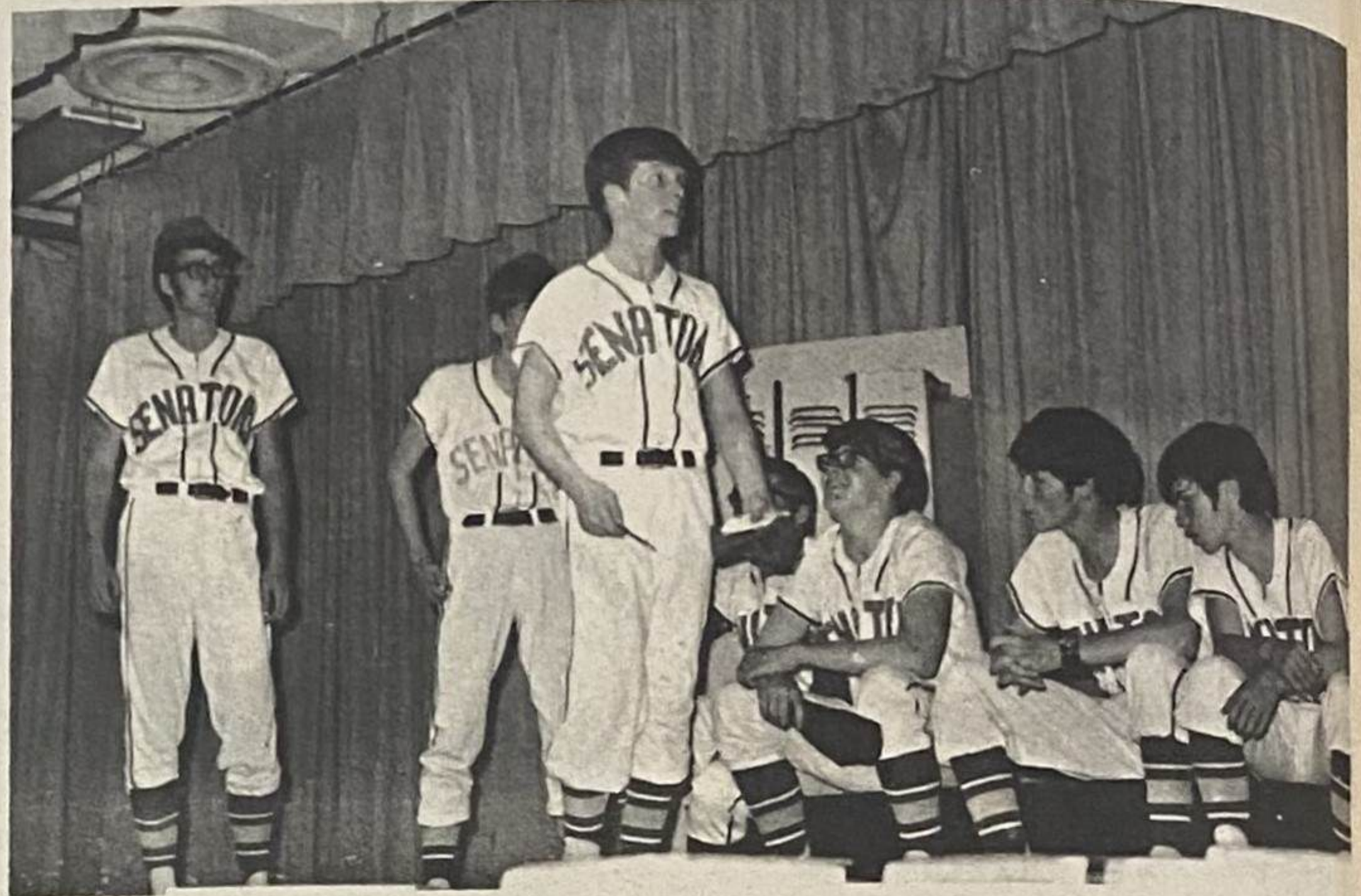
The Senators discuss strategy