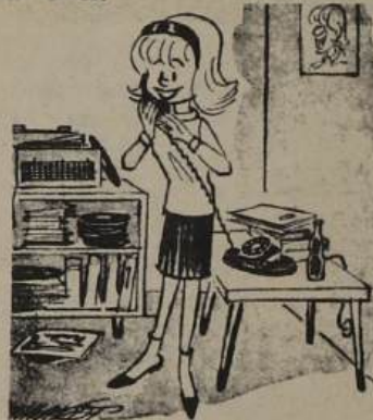
"Go steady with you? I'd love to! Who is this?"

Practical Homemaking senior girls know all about dating techniques now. They are developing values that will help them know what to look for in a prospective marriage partner. They may even know how to get married, if there is a "know-how" to it.