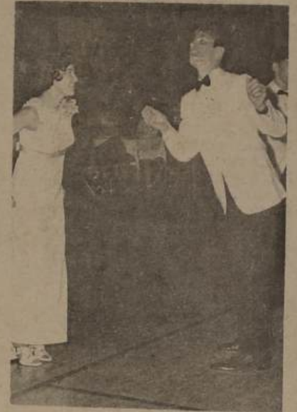
Scenes from Prom