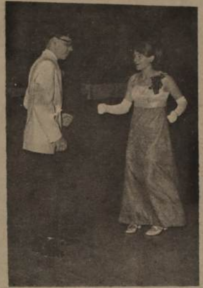
Scenes from Prom