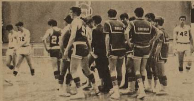
BB Marion vs. Dubuque Wahlert in Clinton