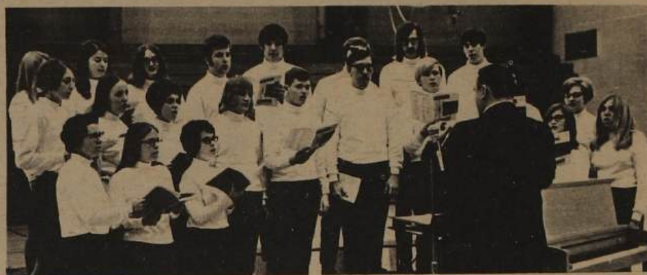
Kirkwood Chorus Entertains at MHS

Maybe this situation will improve. Call it discourtesy or apathy it is still an ugly and disgusting thing to be witness to. Students may develop some respect for authority and actually show some courtesy but I think it will come only when they wish to be respected themselves.