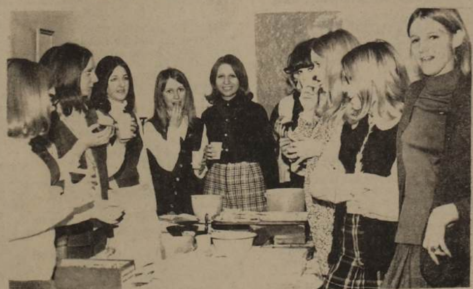
Future Nurses Entertain at County Home