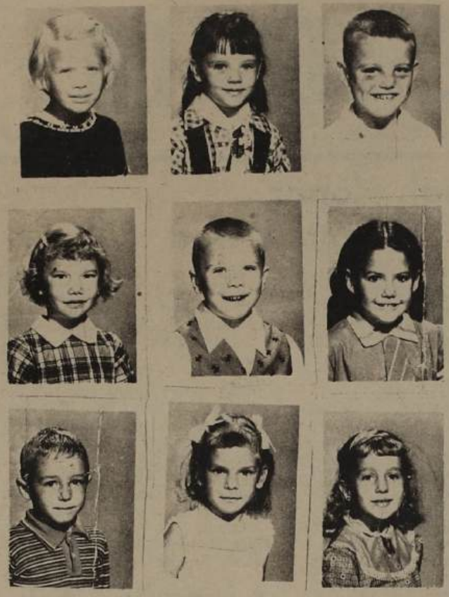
(Identified elsewhere in paper)