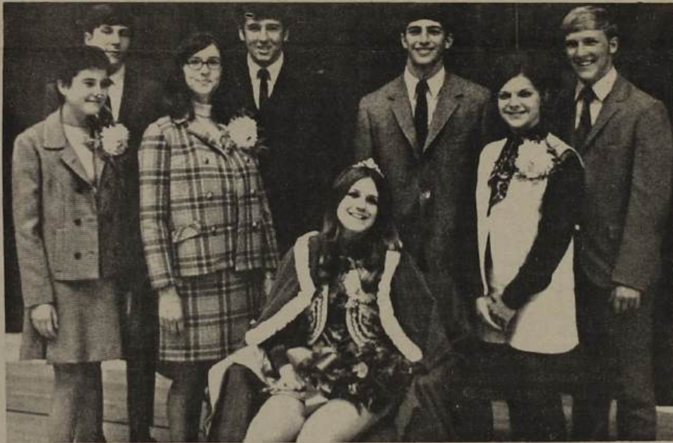
THE QUEEN AND HER COURT