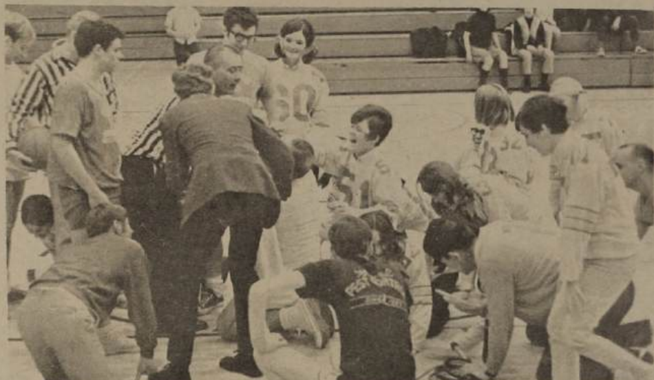
WOULD YOU BELIEVE...?

The track squad, because of bad weather, hasn't really had the opportunity to get the necessary practice underfoot to get well underway. Nevertheless, in a triangular meet held here on April 22, Marion and Maquoketa tied with 76 points apiece, while Monticello lagged behind with 31 points.