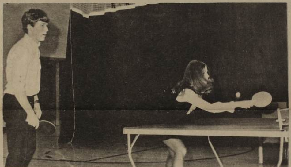
Ping-Pong mixed doubles competition