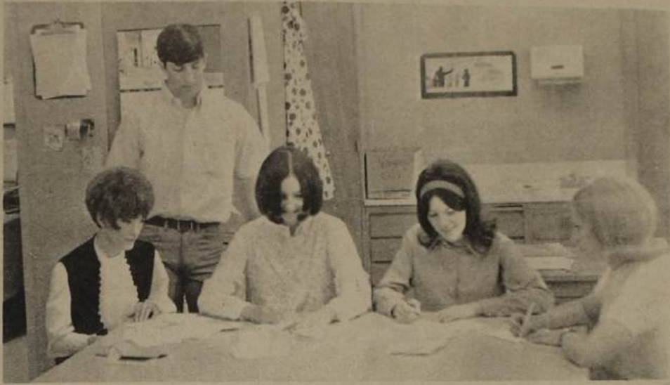
Reading Prom Acceptances - Prom coming Saturday