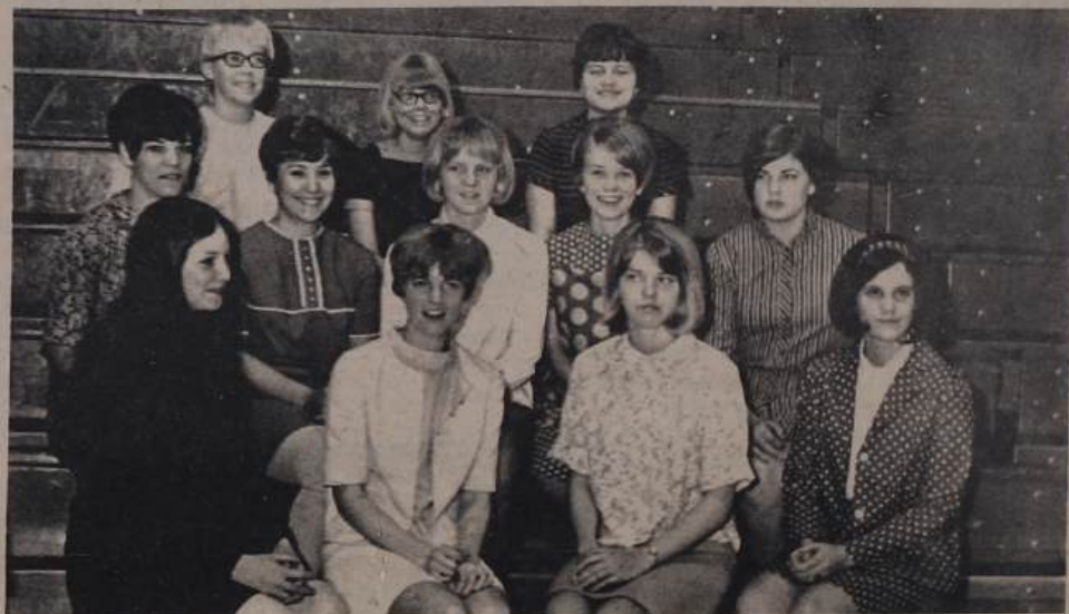
QUILL AND SCROLL MEMBERS

How simple life had been! Back in high school, the flag had been new, clean, starched, and beautiful. Here, now, it was faded and torn--covered with mud...but still beautiful.... In those days, the Pledge of Allegiance was something you said only when you had a substitute teacher, just to fake her out. He remembered one substitute who fell for it every time, even though the class always laughed so hard, he couldn't see why she didn't catch on. He tried to remember the Pledge, but could not. The sight of the crowd, laughing at the flag, was the last thing he remembered before he died.