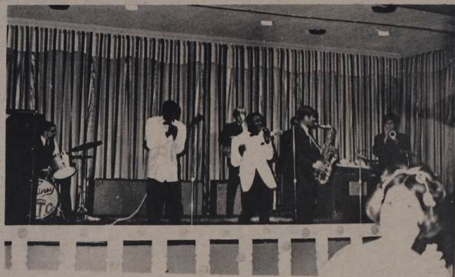
I. B. T. C. provided prom music

With a mist of heavenly moonlight and a favorite date by their sides, they started out at any time from 6:15 on to attend one of the numerous parties held before prom that night.