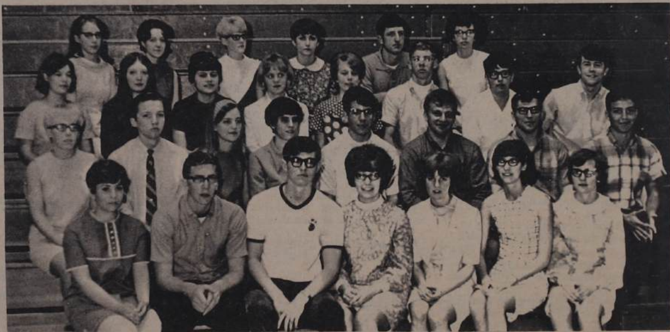
NATIONAL HONOR SOCIETY