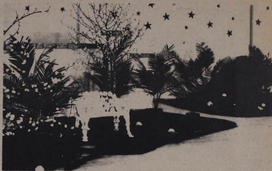
Well-done and well worth remembering