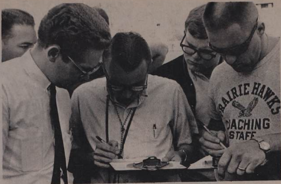
Coaches Register Times