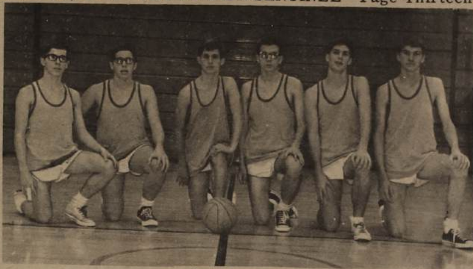
Junior Varsity squad

The juniors are involved in self analysis in regard to vocation and future educational plans. They have been given ITED, Iowa Test of Educational Development, PSAT, Preliminary Scholastic Qualifying Test, and IQ tests. They will soon take the KUDER Occupational Interest Test. The tests are designed to help juniors discover strengths and weaknesses and interests in relation to occupational and educational plans. There