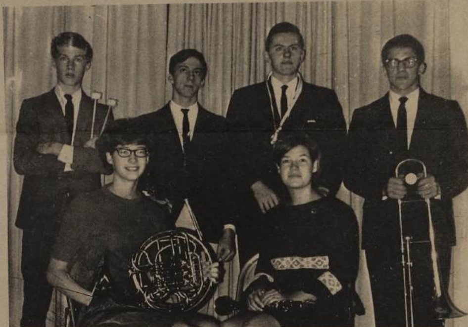
ALL STATE BAND PLAYERS