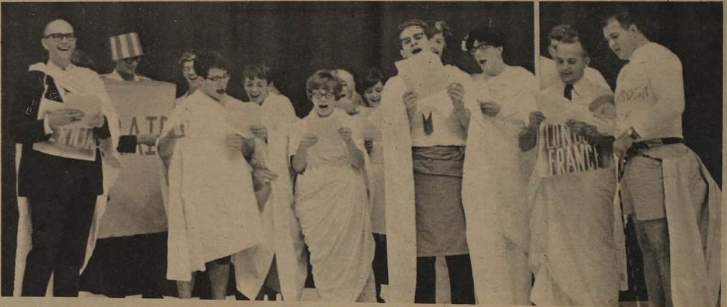
Student Council Skit for Homecoming

Everyone is keeping busy attending sectional rehearsals, playing for pep band, and marching. The marching band is especially proud of its new uniforms this year. These were exhibited for the first time September 20, and will be used hereafter. The Band's first halftime show was staged on October 6.