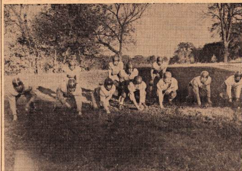
Marion's Freshman-Sophomore Football team captured second place in the WaMaC Conference. Above are the first string linemen and backfield.