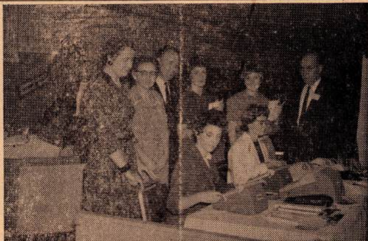
The Future Business Leaders of America is a new organization at MHS this year. Here we see the sponsors and some members at an exhibit. See story on Page Three.

The juniors embarked on their annual magazine drive September 16, 1960, and ended it October 3. They raised $2,840.92, of which $978.00 was profit.