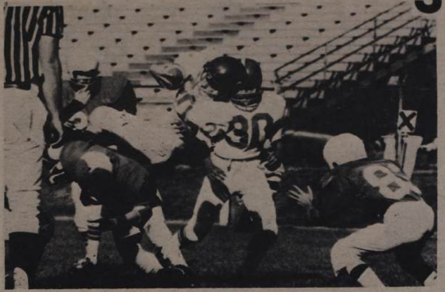
THE 7TH GRADE FOOTBALL TEAM IN ACTION.