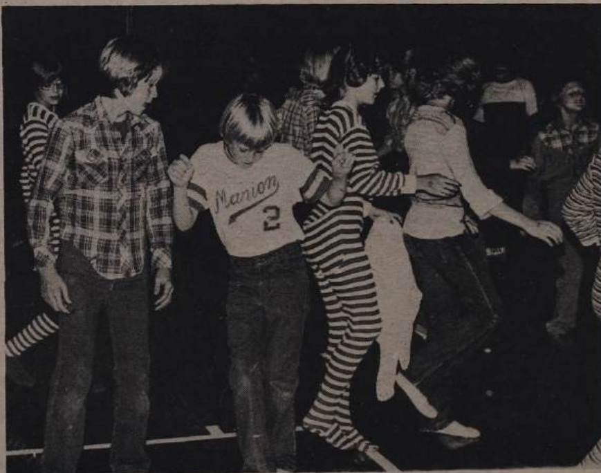
STUDENTS SHOW HOW IT'S DONE AT THE HALLOWEEN DANCE.

December 6, 7:30 p.m., vocal (and band) Christmas Concert