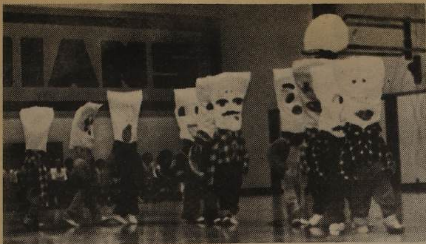
"SHORT PEOPLE" scored a hit at the recent Vernon Talent Show.