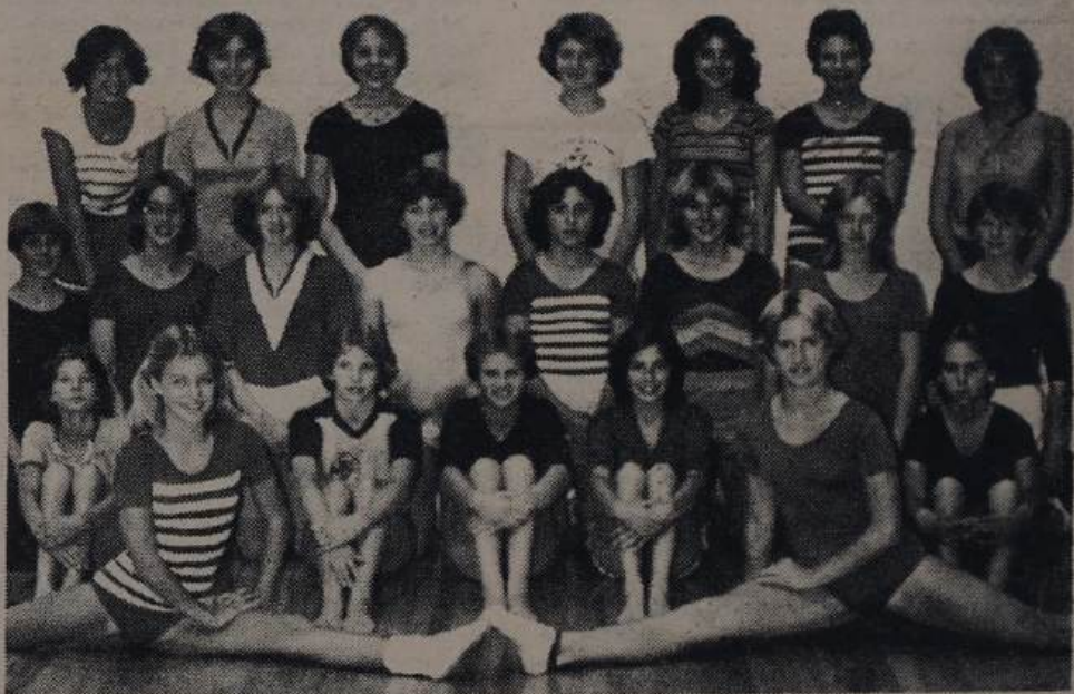
EIGHTH GIRLS' GYMNASTICS TEAM