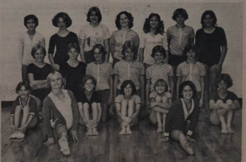
GIRLS' GYMNASTICS -- SEVENTH GRADE