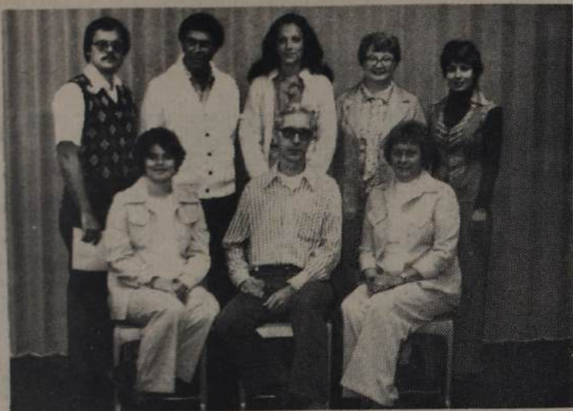
NEW TEACHERS AT VERNON MIDDLE SCHOOL