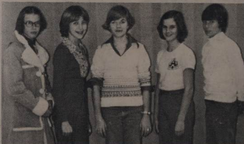
Five of the Top Sellers in the Recent Magazine Sales Campaign