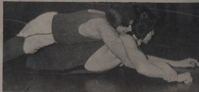
It's Work No Matter How You Look at It