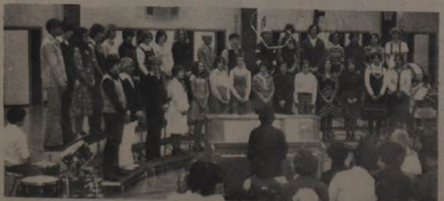
8th Chorus Performs at the Christmas Program