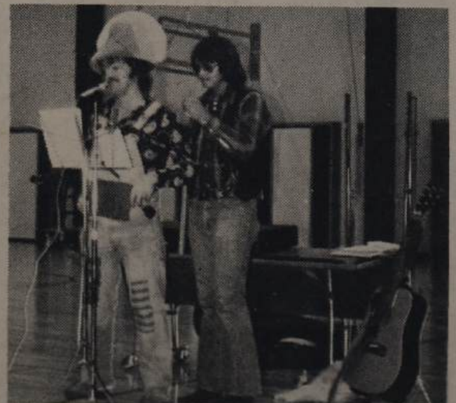
A Pair of Country Boys at a Recent Assembly

(The seventh grade members of the Dramatics Club have chosen a one-act comedy, "The Capricious Pearls", to be performed on Feb. 23 at the high school. The cast will consist of four boys and nine girls, to be selected in one week.)