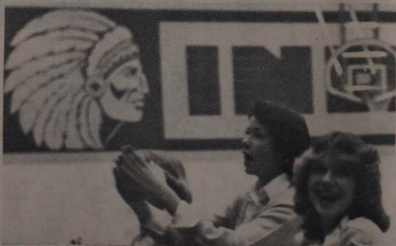
8th Cheerleaders Support the