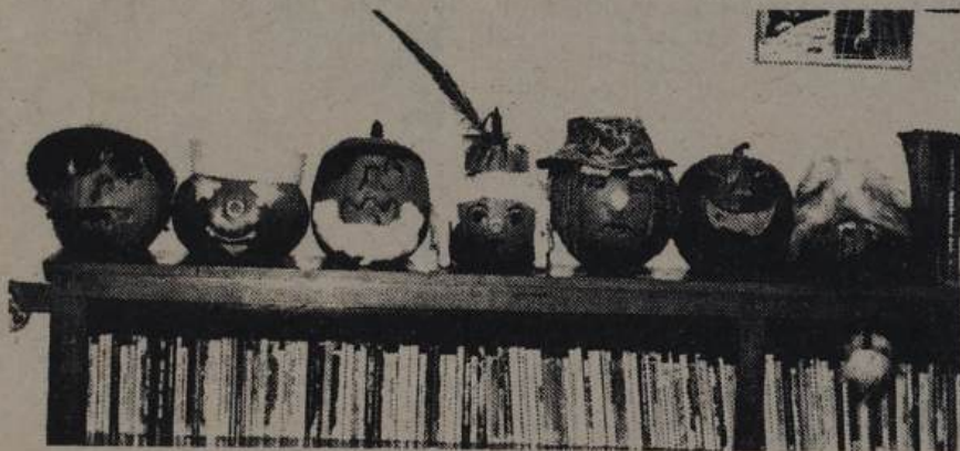
Entrants in Pumpkin Decorating Contest.