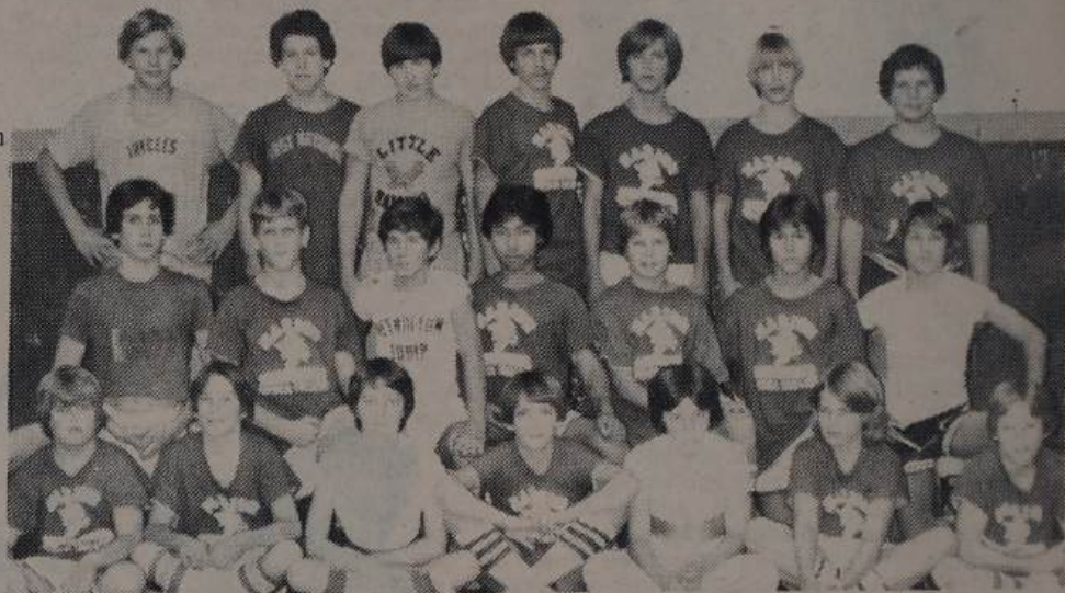
7TH GRADE WRESTLING SQUAD