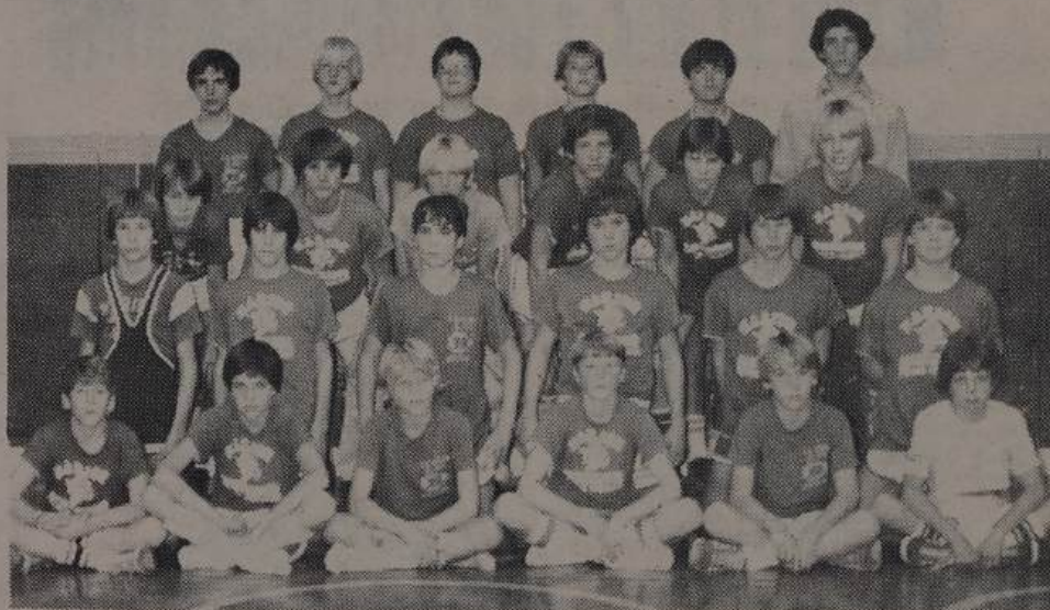
8TH GRADE GRAPPLERS