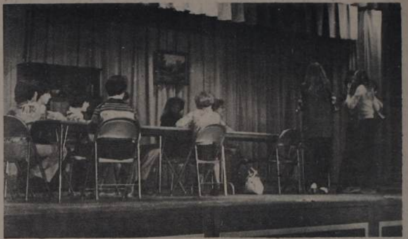
"So the Jury Was Hung."