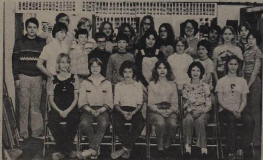
Ribbon Winners in Instrumental Music.

Because of illness, some ensembles were short members.