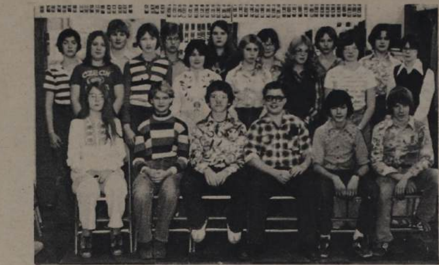
Instrumental Music Winners