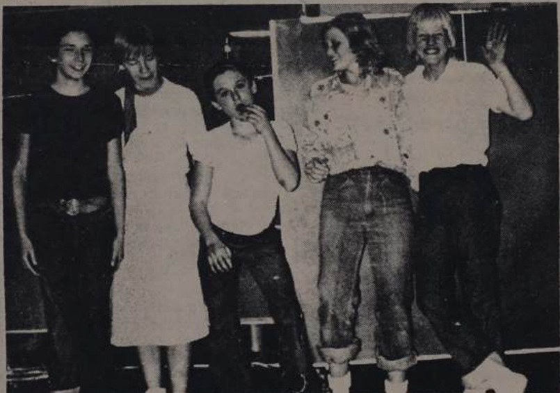
Smile, Cute Stuff!! The 50's.

Look for asparagus with tightly closed tips at the end of firm, straight stalks. Older and tougher stalks have open tips.