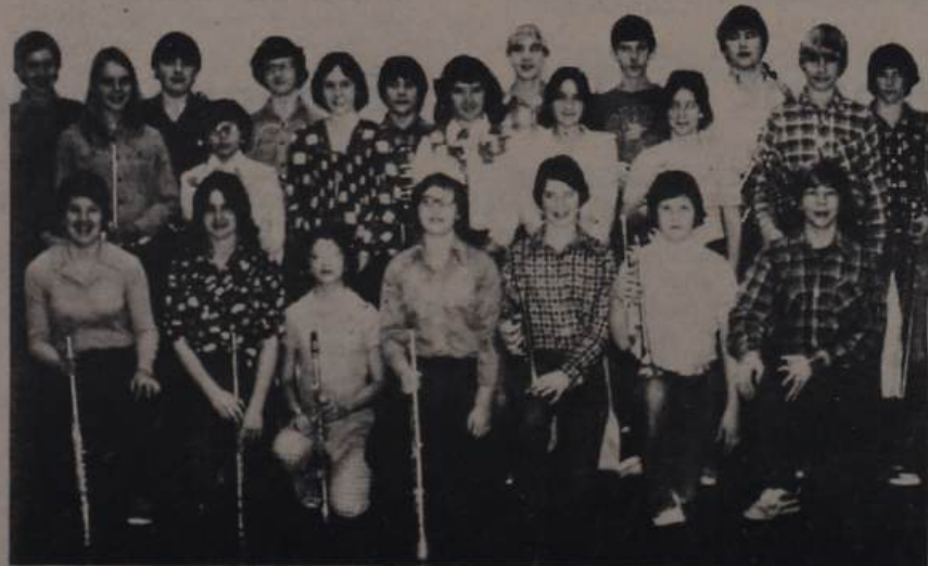
More Ribbon Winners at Linn-Mar Festival