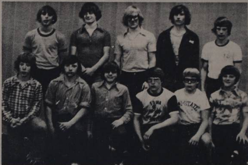
Boys Who Have Competed in Post-season Wrestling Tournaments

Good luck to these Dramatics Club members on April 27, when they present the two plays.