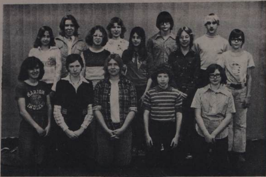
Finalists in Spelldown, with WaMaC contestants in Foreground