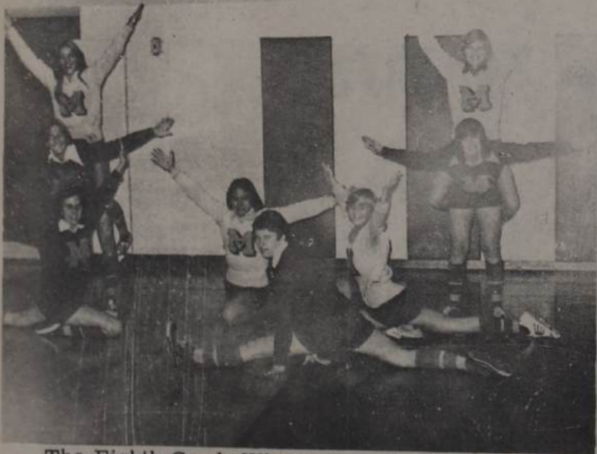
The Eighth Grade Winter Cheerleaders at Work