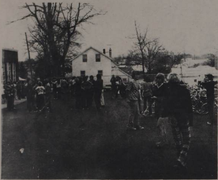
Out For a Break