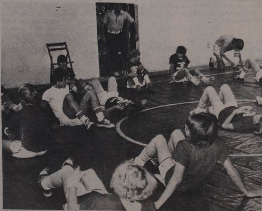
Physical Ed. Boys Limbering Up