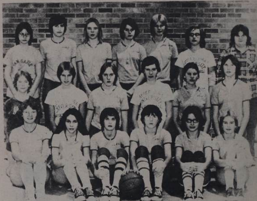
8th "A" Girls' Basketball