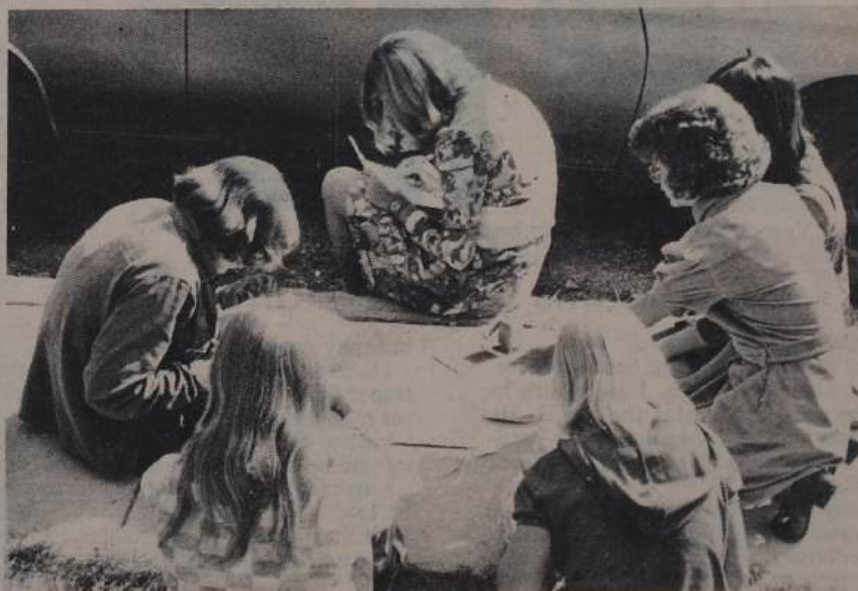
Science Students Plotting The Sun