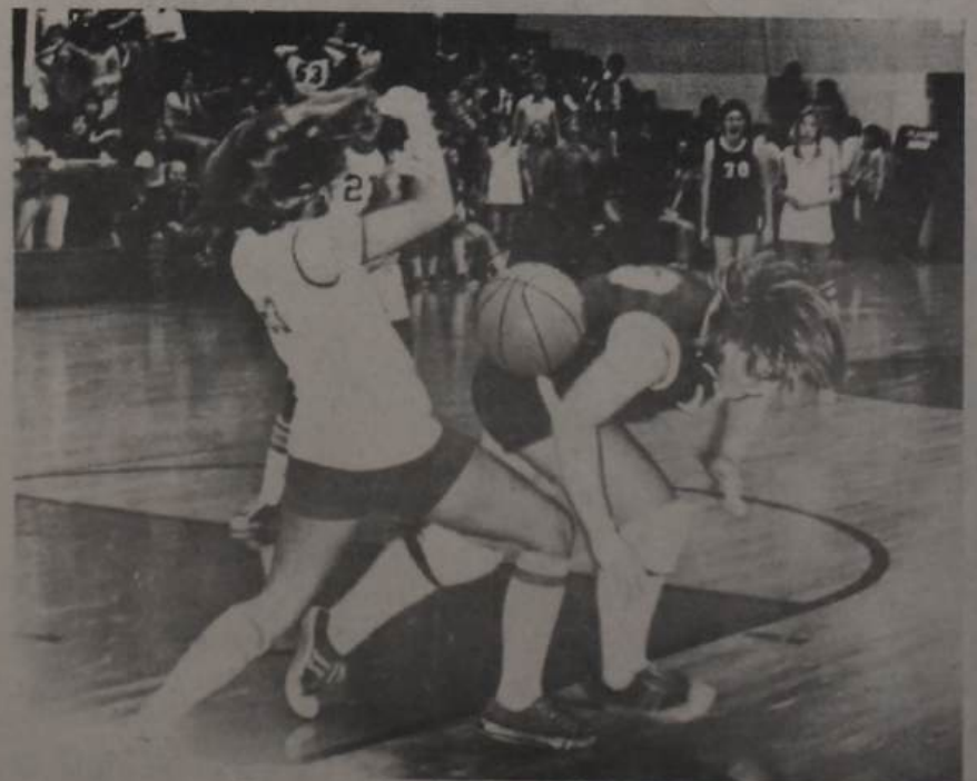
Vernon Girls Tear 'Em Up