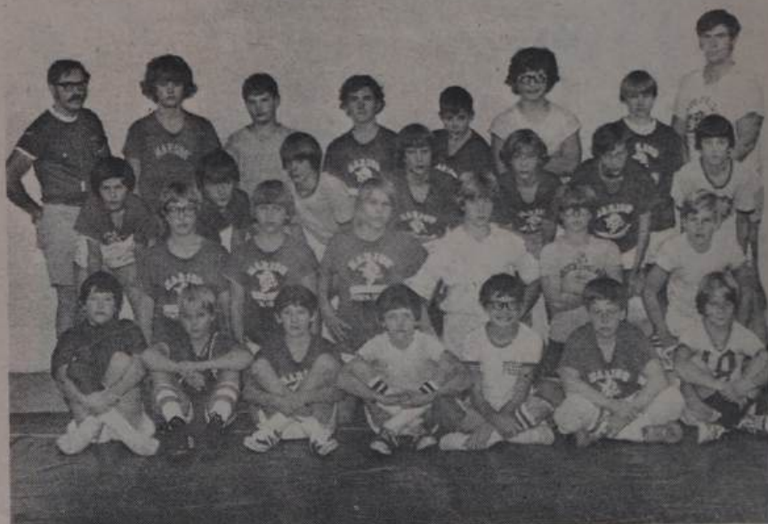
More Members of Vernon's Wrestling Team