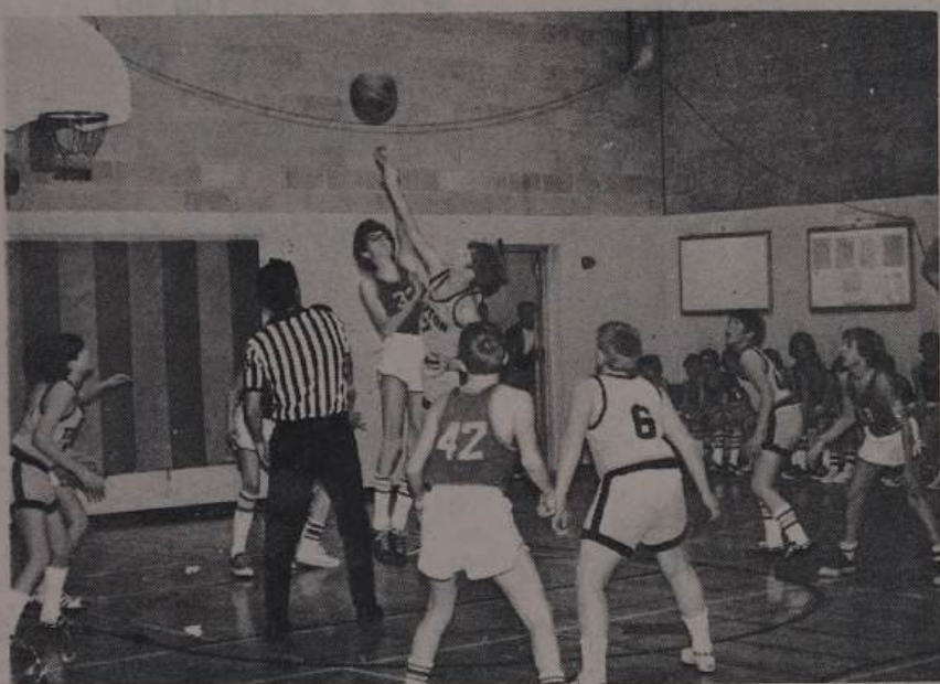
The Tip -- 8th Basketball