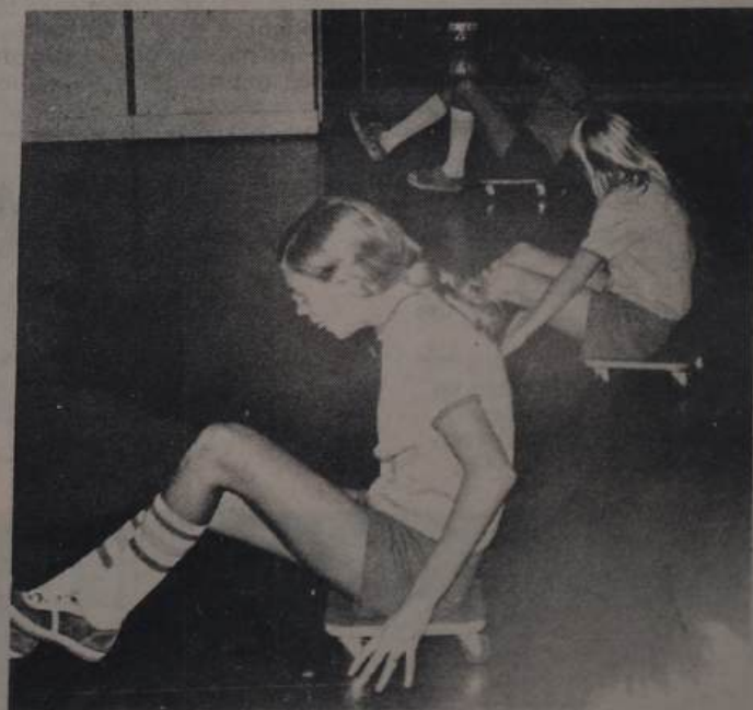
Scotering in Gym