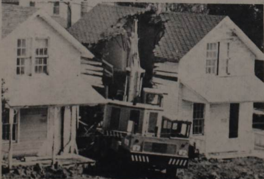
The Buildings Go Down Across 5th Ave.