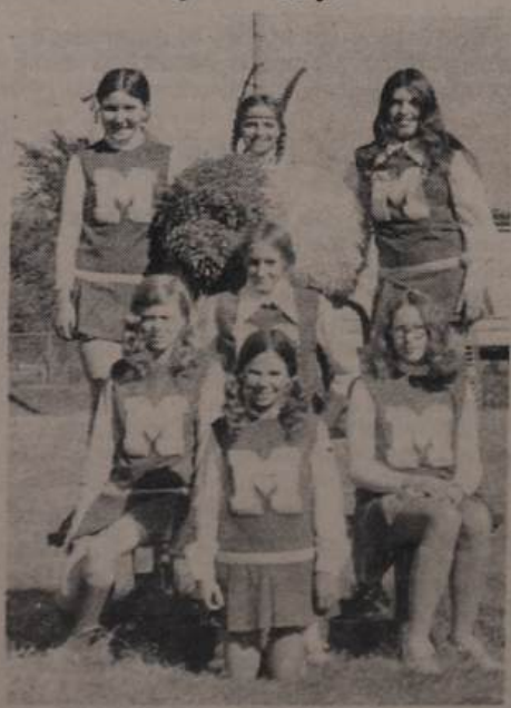
7th Grade Cheerleaders