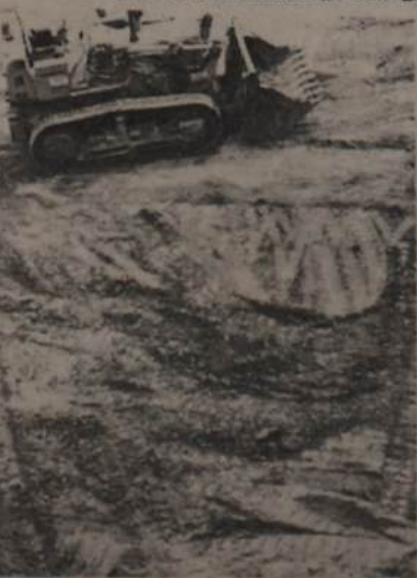
Digging a Hole For the New Gymnasium

As most of you know, Vernon Junior High is undergoing a renovation project. There are many improvements being made including a new gym, industrial arts shop, girls' and boys' locker rooms, wrestling room, kitchen, library, and art and music rooms. There will also be renovation done in the Science, Social Studies, and English departments. Some of the work will be done on student-aid areas, including