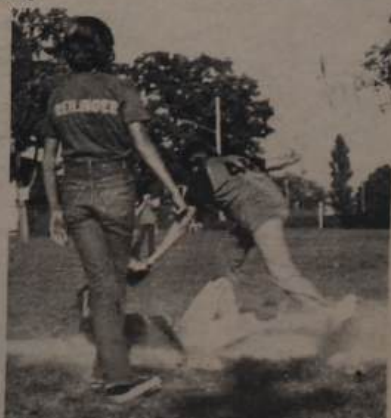
ACTION IN GIRLS' SOFTBALL