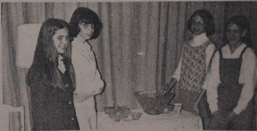
It was very unusual punch.