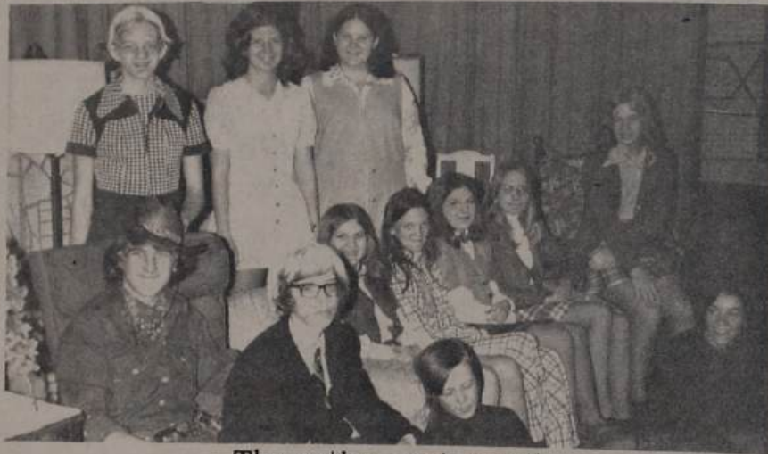
The entire cast posed.