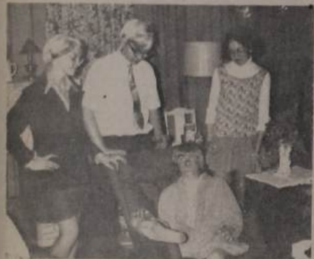
Wilbur is impossible!

more "Life of the Party" pictures on page two.