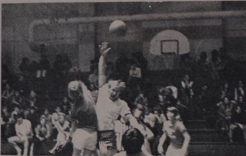
The action was fast in the faculty-eighth grade basketball game.