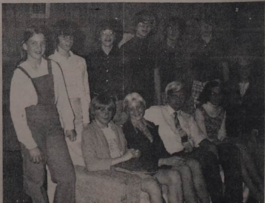
The entire cast poses.