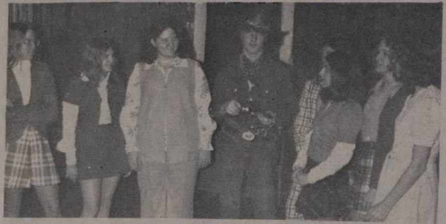
The students at the Caldwell School for Girls really admired Colt Winchester.