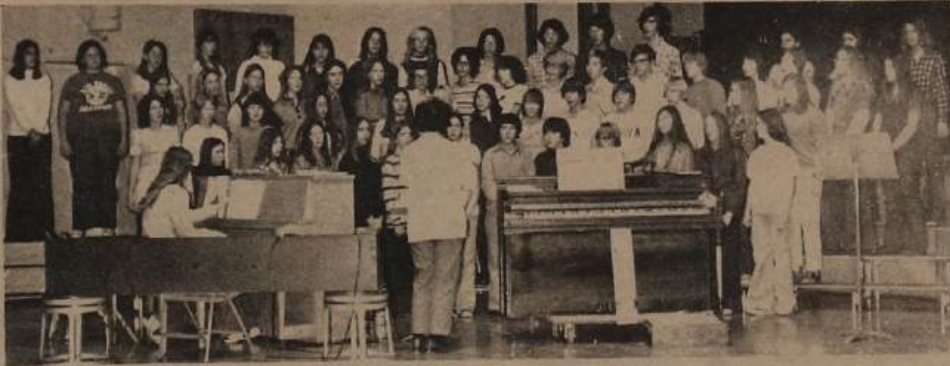
The eighth grade small group rehearsed many hours to present "'Twas the Night before Christmas."

when the tidal range is far apart or when you have high-high tides and low-low tides. Neap tide is when you have a little tidal range or when you have low-high tides and high-low tides. The MESSENGER is happy to have untied the tides for our faithful readers.