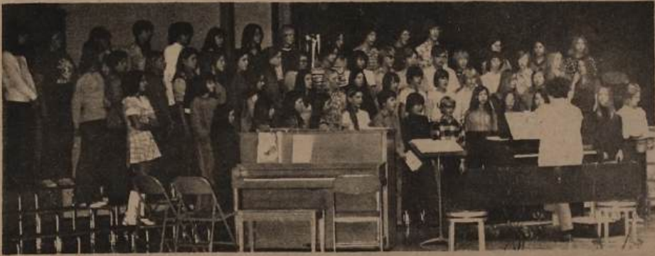
The eighth grade chorus rehearsed for the concert.