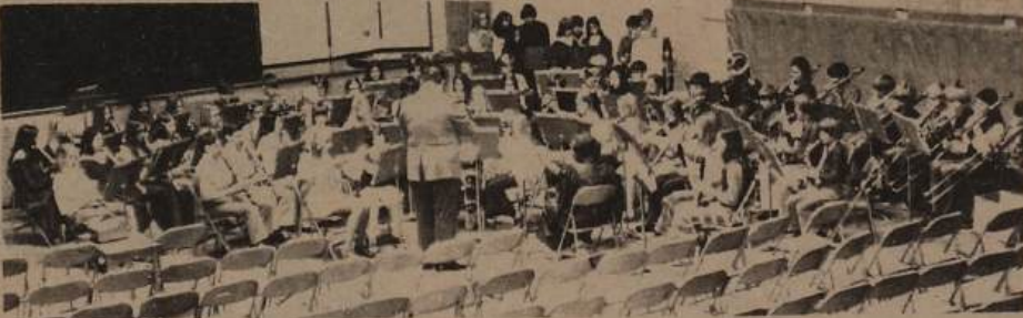
The band played for the student body December 11.