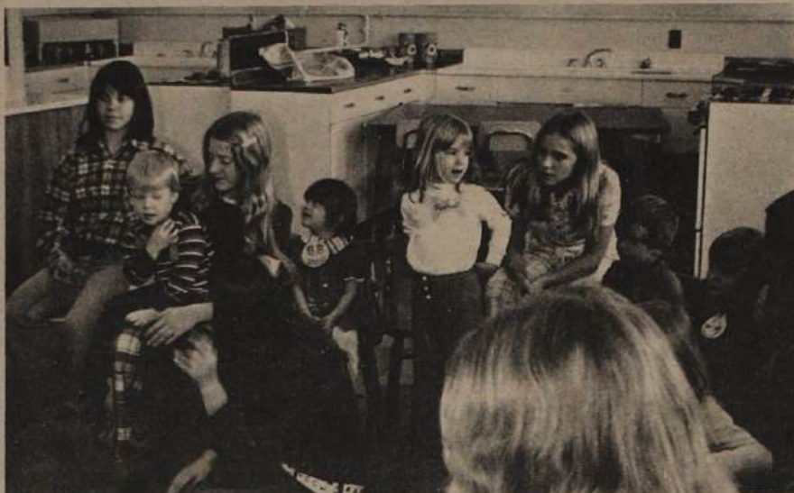
It's lots of fun at playday!

Most of you have noticed the stuffed animals in the glass case in the west hall. These are for the eighth grade girls child care project. Each girl made a stuffed animal, doll, game, learning aid, or toy of some kind. One even made a riding horse. There will be lots of very happy little children who receive these this Christmas.