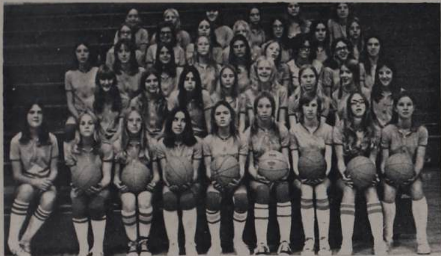
8th GRADE GIRLS BASKETBALL TEAM see story, page 2

Vernon Junior High School November, 1973