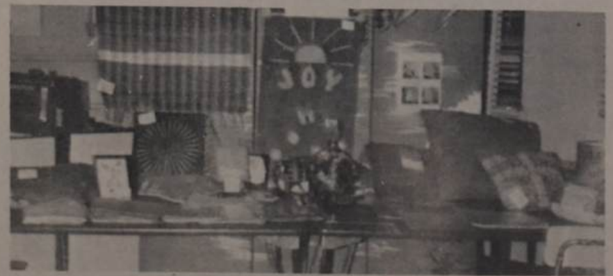
Home Ec exhibits at Open House