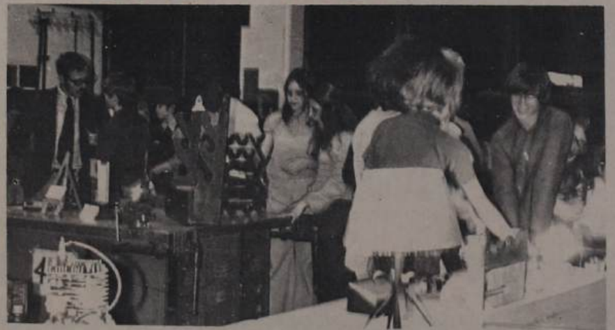
Industrial Arts exhibits at Open House