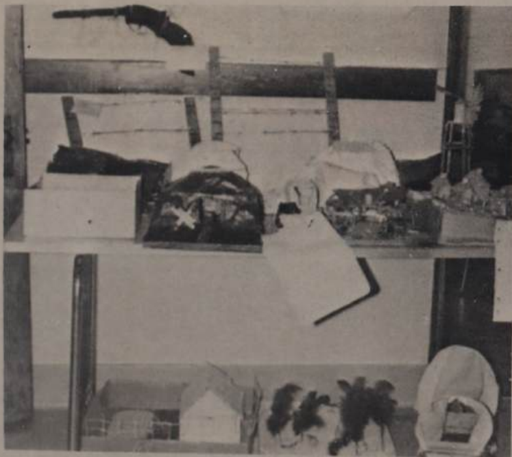
Social Studies exhibits at Open House

Members of the Library Club will be receiving end-of-the year awards. In order to receive an award you could not miss more than two meetings during the year.