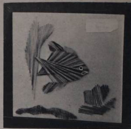
This looks like art but is really a math project!

"You don't have to travel around the world to understand that the sky is blue." (Goethe)