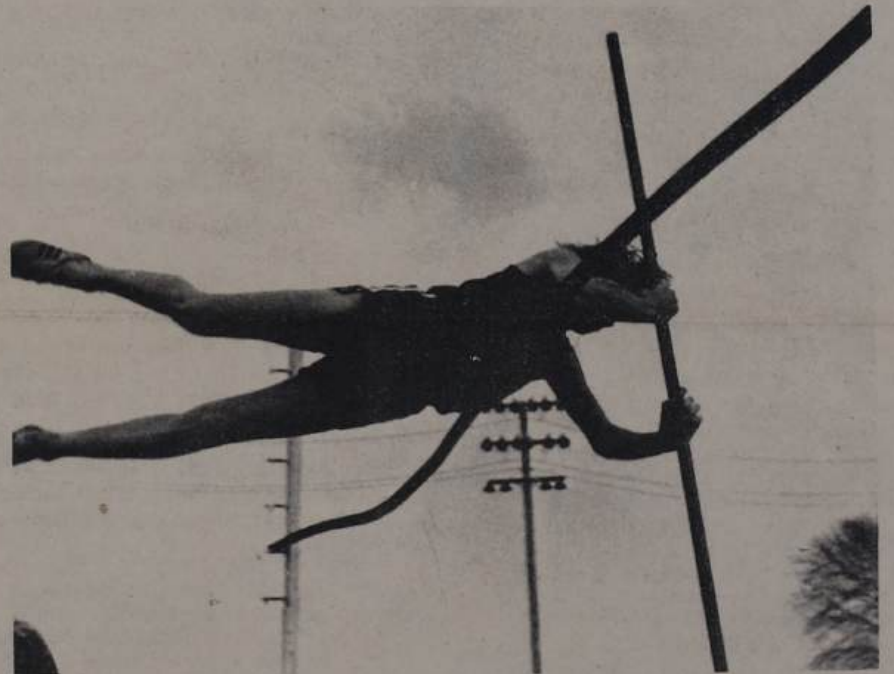
Tim Ford clears the bar in the pole vault