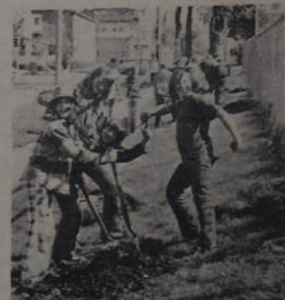
It takes a lot of muscle to plant trees on May 12.

It started at 9:00 and continued until about 11:00. The trees were planted on the inside and outside of the school fence. They are all young trees. Not all the right kind of trees came, so substituted trees were planted in their place. Now all that the trees are planted it looks very nice.