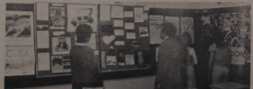
Social Studies exhibits at Open House