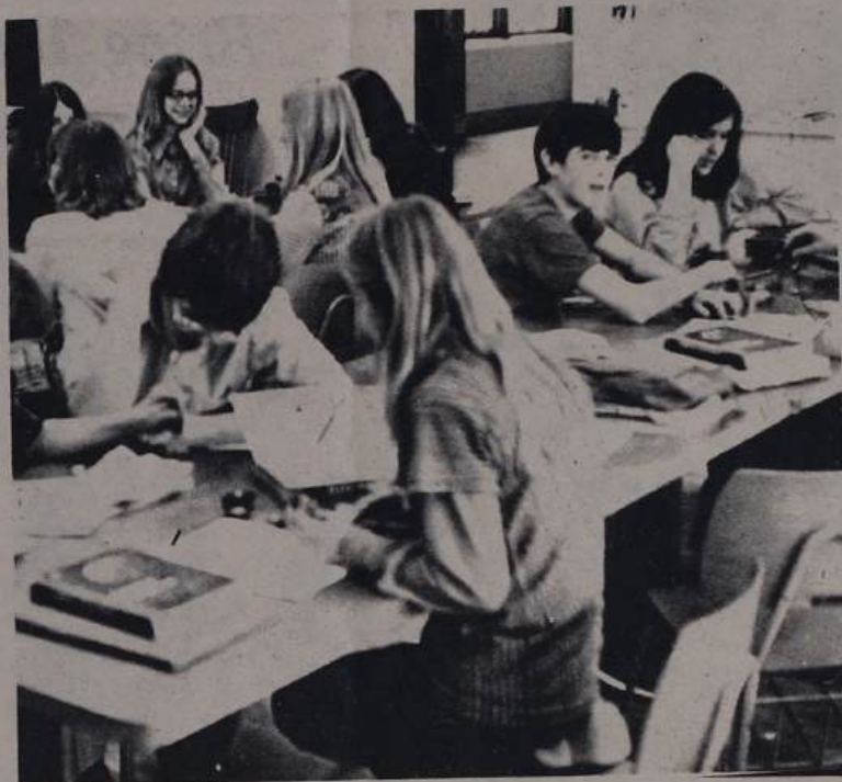
The rumor that 8th graders have rocks in their heads is at least partially confirmed. Here several struggle to identify common rocks as part of a science test.