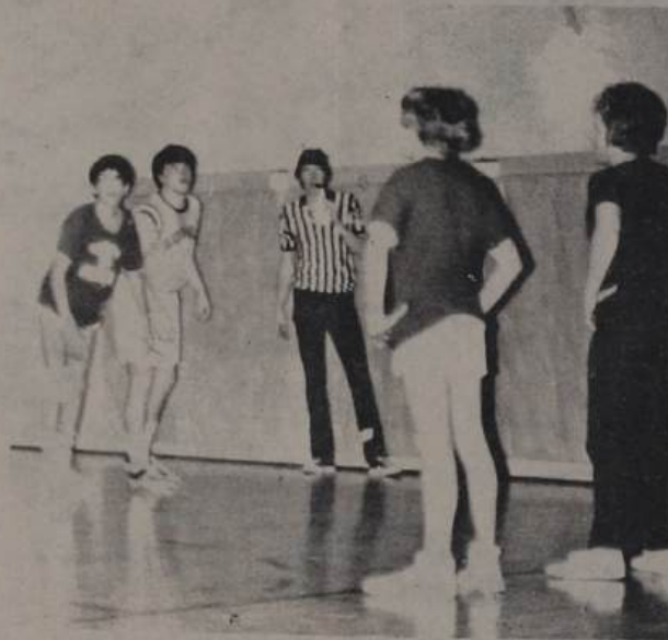
They're ready for a rebound in the faculty-8th grade game.