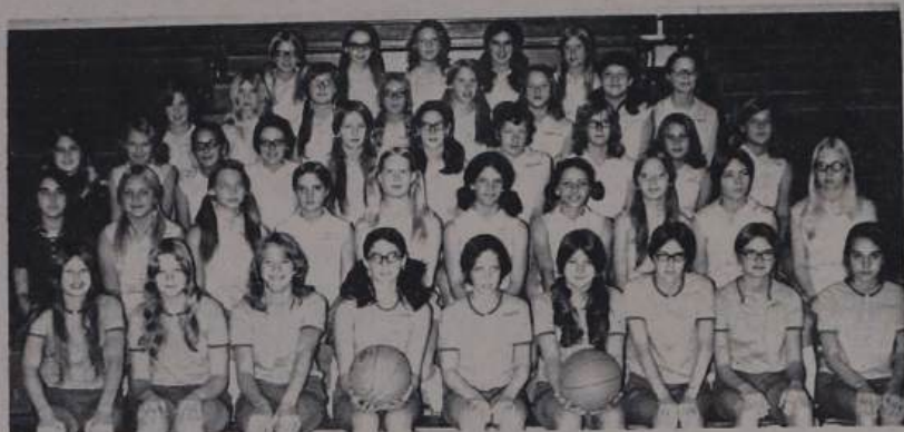
8th grade girls basketball squad