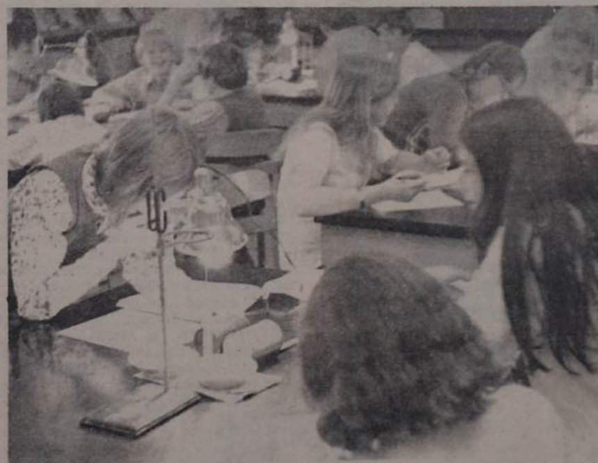
Eighth grade scientists measure heat differences in land and water.