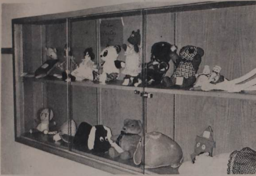
Part of the menagerie of toys for children made by the home ec girls is on display.

I bet the only place you have seen a lot of animals in one place is at the zoo. If you have been in the home ec room lately, you would know we have quite a zoo in there ourselves. Why? Well, the home ec classes are having a child care unit. We were supposed to make something that