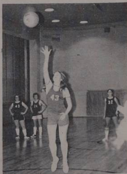
Eighth grade girls basketball action