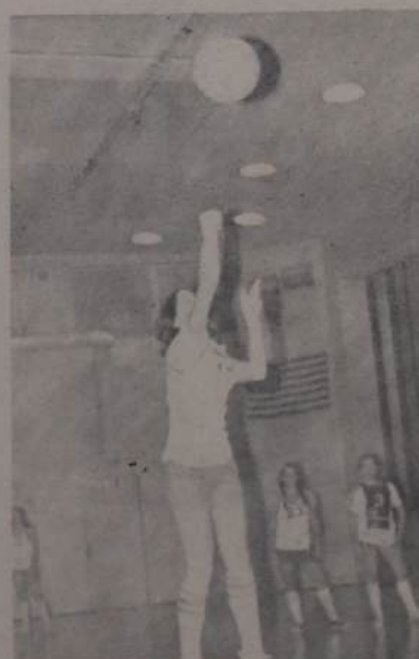
Seventh grade basketball action.