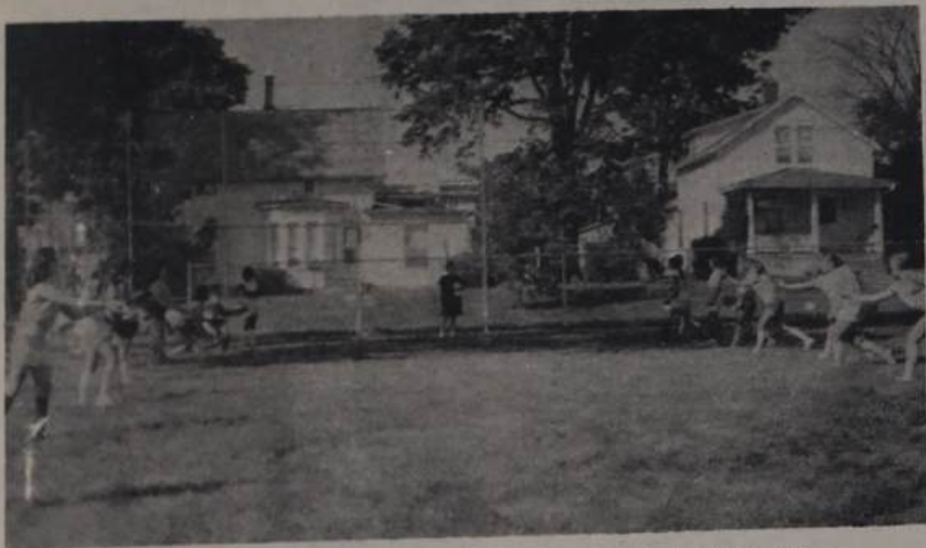
The new fenced-in playground gets regular use by Phys. Ed. classes.