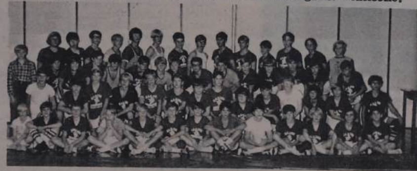
Wrestlers are prepared to meet any foe.