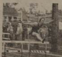
Perry Anderson leads hurdles

The girls had to be at the school at 8 o'clock. The bus left for Palisades at 8:15. When they got there they started breakfast and ate. Then they could hike or do anything they wanted to until noon as long as they didn't go in or near the water. At noon they ate and after lunch until 3:30 they could do anything they wanted to. But at 3 o'clock, it started to rain so they had to leave early.