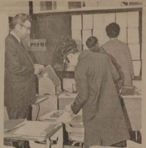
7th LANGUAGE ARTS