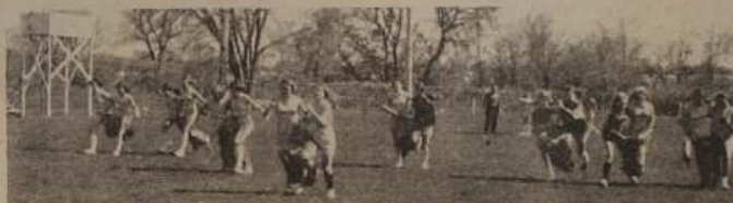
THREE LEGGED RACE