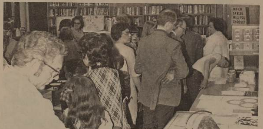
7th SCIENCE EXHIBITS