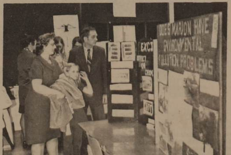
8th SCIENCE EXHIBITS