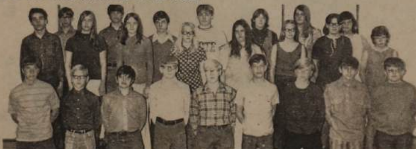
BEST WISHES FOR A HAPPY SUMMER FROM THE MESSENGER STAFF AND CAMERA CLUB.