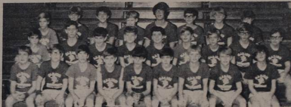
7th GRADE A SQUAD BASKETBALL