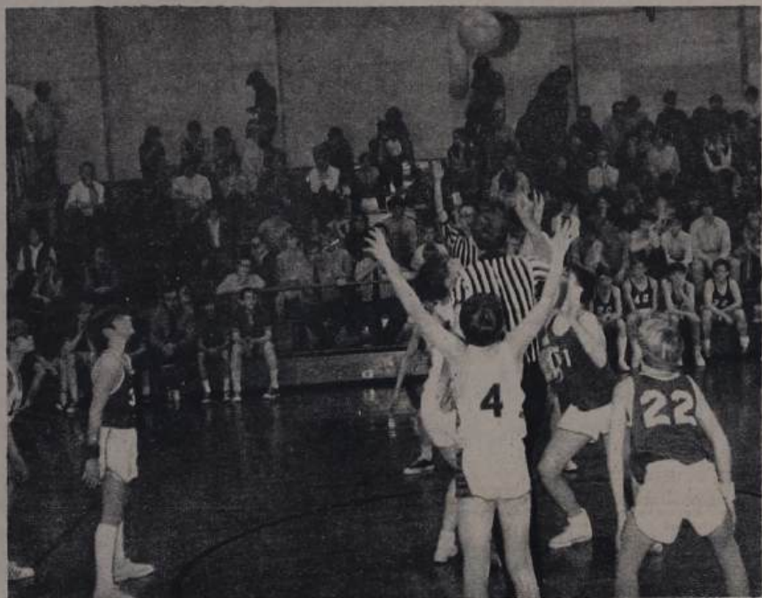
Seventh grade basketball action