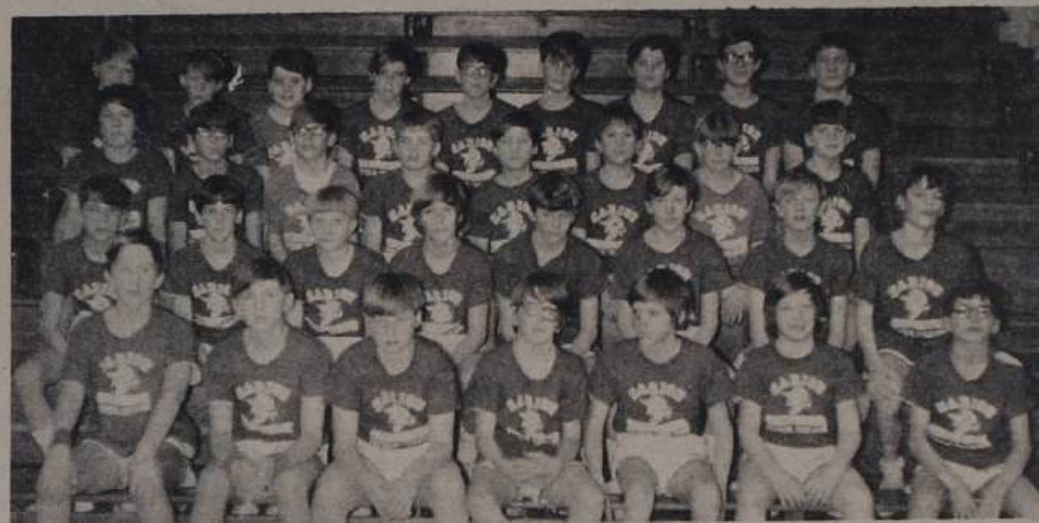
7th GRADE B SQUAD BASKETBALL