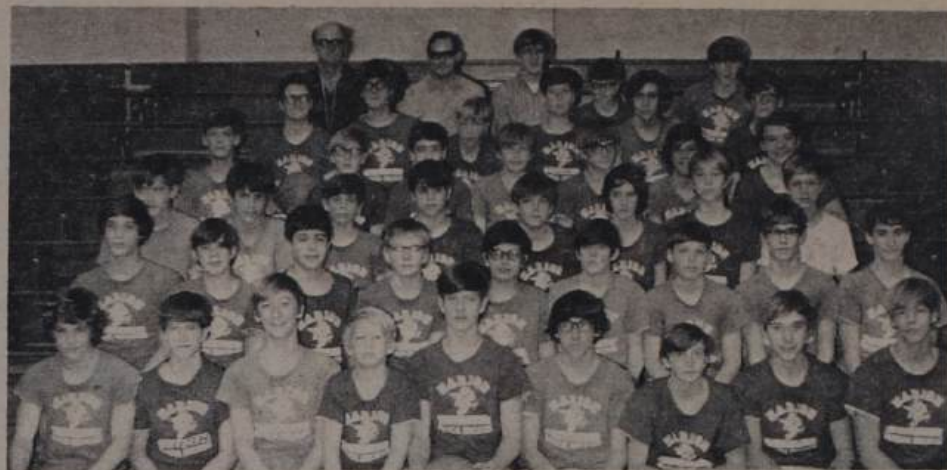
8th GRADE BOYS BASKETBALL TEAM

With the money the Library Club has collected they are planning to take a bus to the book bindery and then go on a picnic afterwards.