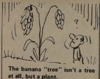
The banana "tree" isn't a tree at all, but a plant.