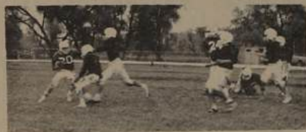
FOOTBALL ACTION--8th Grade Jr. High Versus Linn-Mar