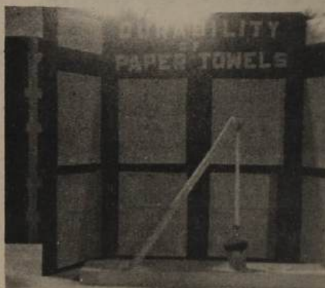
"Durability of Paper Towels" Karen Folkers