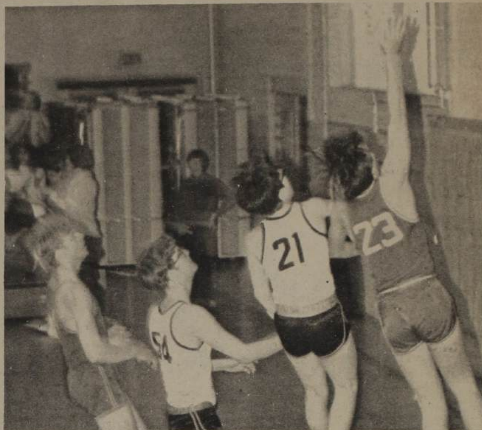
Eighth grade basketball action is pictured above.

We urge parents, girls, and boys alike to aid us in achieving this goal toward which we are working.