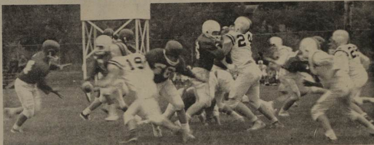
"Action" was the word as the eighth grade football team battled it out with Manchester on September 23 on the Indians' field. The Manchester team proved too much for the Indians, defeating them 18-6.