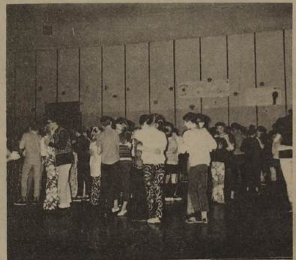
Sloppy Joe Day, April 1, was followed by an after-school dance. Casual costumes were plentiful and colorful on the dance floor.