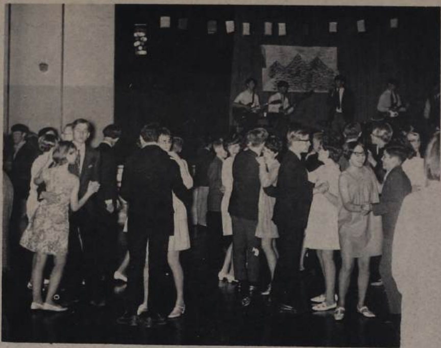
Something new this year. A live band was on hand for the Spring Dance. The students danced to and enjoyed the music of the Seven Foot Clearance.