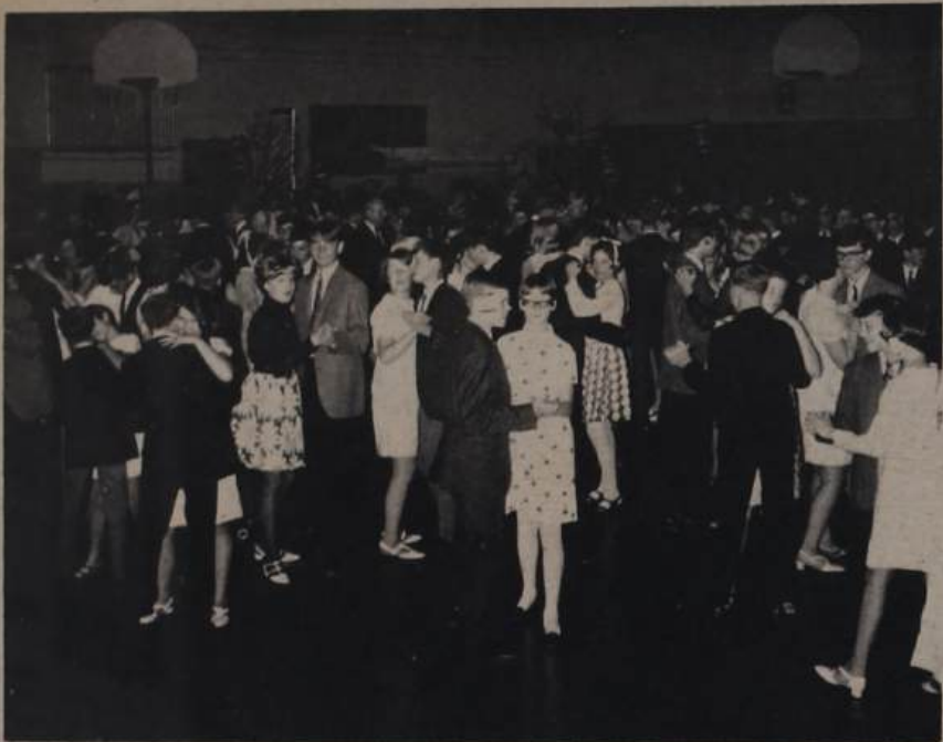
The Spring Dance was very well attended as evidenced in this picture.