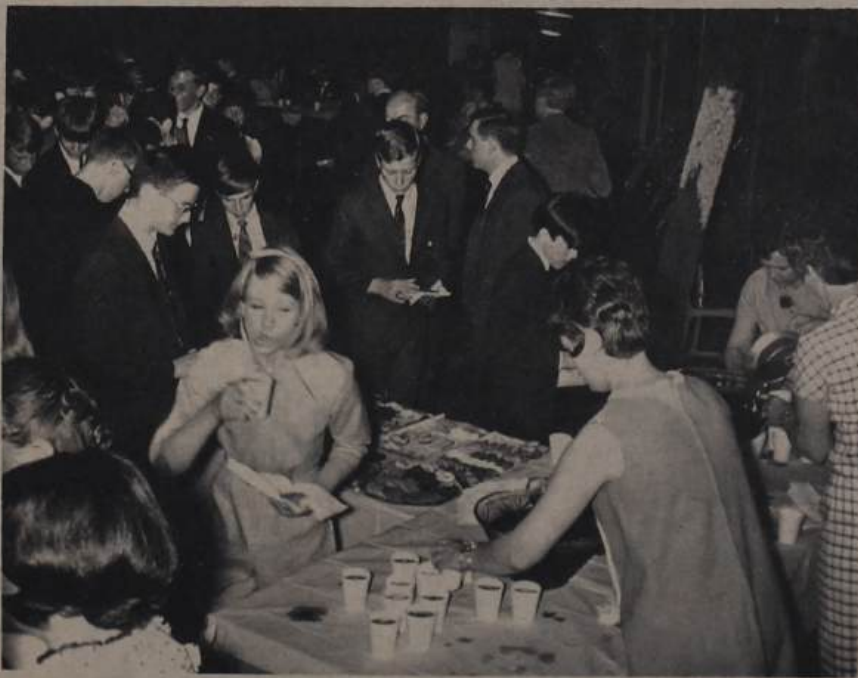
Refreshments of cookies and punch were served at the conclusion of the dance. A group of parents formed the refreshment committee.

The seventh grade science club met April 30. Twelve members were present. Officers present were the president and the secretary. They recorded the heart beats on the tape recorder and played it back. The meeting ended at 4 p.m.