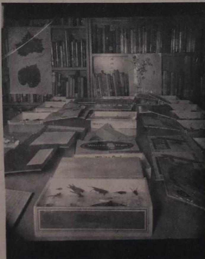
The seventh grade science students again had their insect and leaf collections on display at the Spring Open House held at Vernon Junior High Monday, April 22.