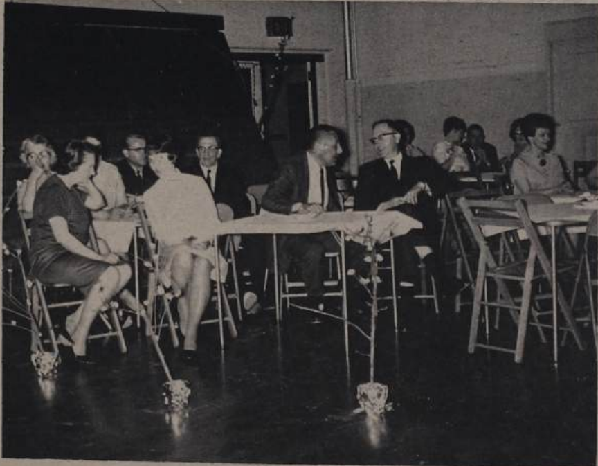
School board members were invited as chaperones for the dance. This corner of the dance floor was reserved for the board members, parents on the refreshment committee, and teachers. They enjoyed watching the dancing, but seemed unwilling to participate. (Perhaps the music wasn't fast enough!)