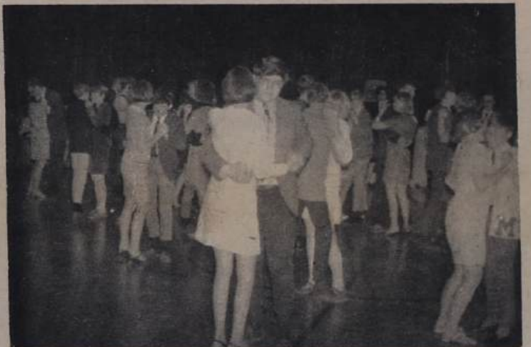
Junior high dances are always popular events. The recent dance held for eighth and ninth grade students was enjoyed by those who attended.