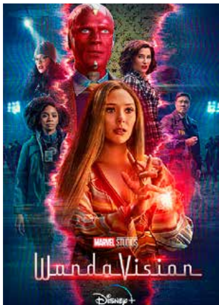
A promotional poster for the new Disney+ series WandaVision.

There's nothing wrong with a titular superhero story, especially if it's Marvel since they are the best at making an engaging and well thought out superhero movie. A lot of movie snobs get on their high horse when it comes to superhero movies, claiming the movies are bad with lame reasoning like "the good guys always win and the villain always loses." Yes, the good guy wins and bad guy loses, like 95% of every other movie. It's a movie about superheroes; it doesn't need to